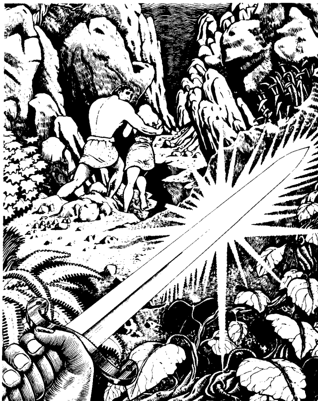
"God placed angels and a blazing sword at the only entrance to the Garden."

God also drove them out of their beautiful garden home. He knew it would be cruel to allow them to eat of the Tree of Life and live in unhappiness forever. God placed angels and a blazing sword at the only entrance to the Garden. They stopped anyone from entering the Garden