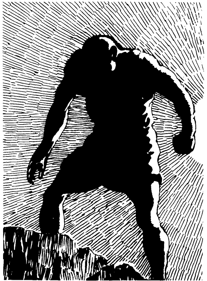
Cain called out to God, “My punishment is more than I can bear.”

Once again, God had to punish one of His human children for disobedience. But God's punishment is always done in love and for a reason. God doesn't punish out of hate. He doesn't seek to get even with the sinner or to make him pay for his