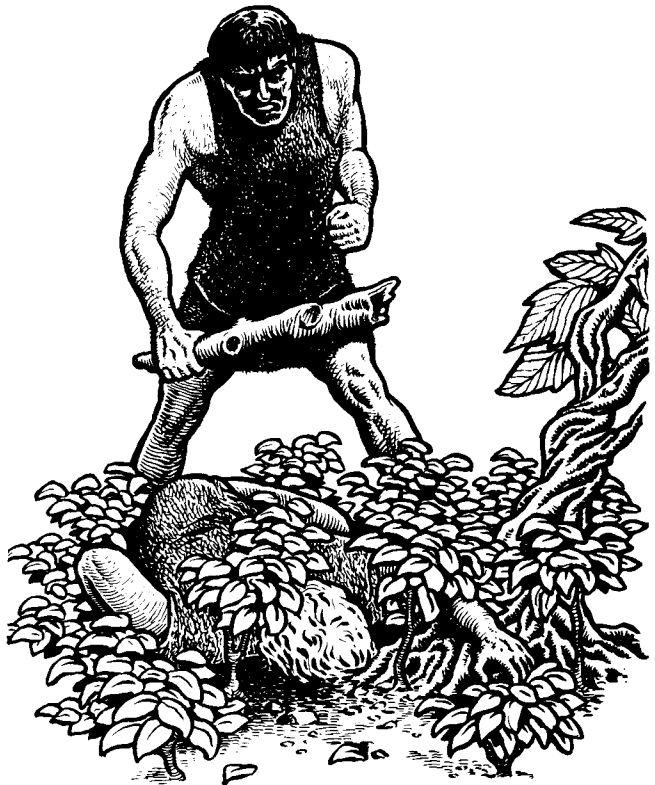
By allowing hate to control his mind, Cain became the world's first murderer!

Shortly after this, when Cain and Abel were alone in the field, Cain turned on his