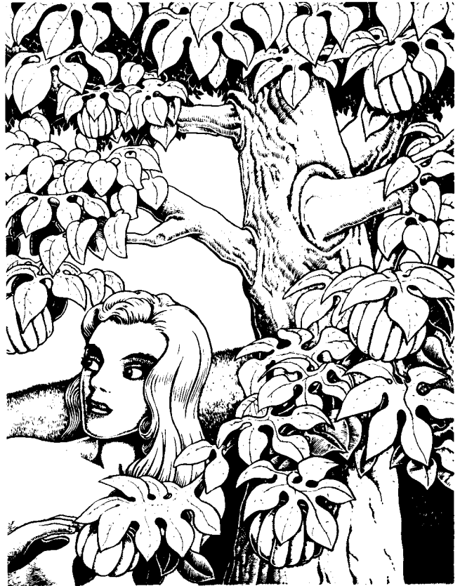
Eve finally gave in to temptation and took the fruit of the forbidden tree and ate it.

Satan, the sneaky serpent, had cleverly deceived Eve into believing his lies. She had been tricked. Eve didn’t know that she was making the wrong choice.