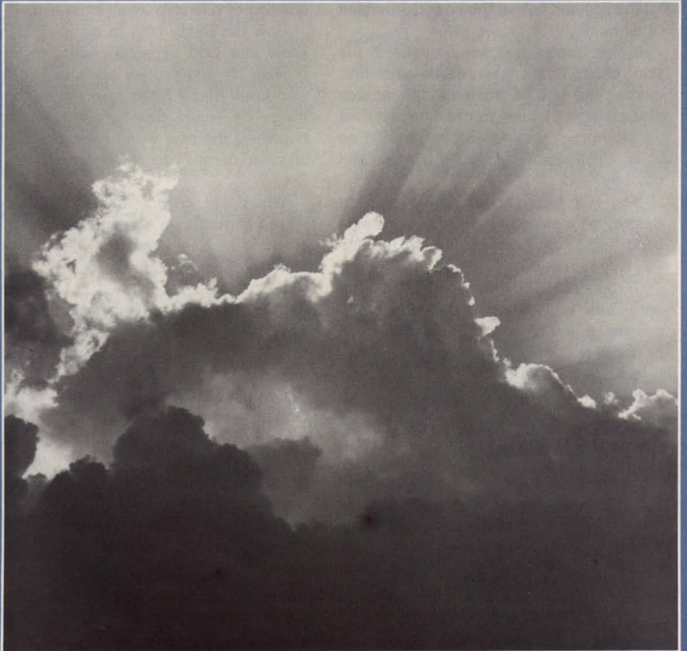
Man's History Begins