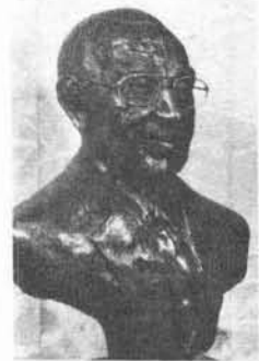
BRONZE BUST — This bust of Herbert W. Armstrong in the Ambassador Auditorium was sculpted by a member from Pennsylvania.