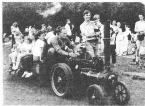
ALL ABOARD — Children ride on a miniature train pulled by a steam locomotive during a barbecue given for about 20 congregations by the St. Albans, England, church.