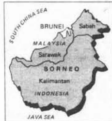
ISLAND OF BORNEO — Brunei is on the island of Borneo, southwest of the Philippines.

a traditional Bruneian wedding. The bride and groom wear gold jewelry and hand-woven garments in-laid with gold thread.