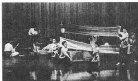
ART OF WEAVING — Four couples, each holding between them a cloth used for royal finery, portray the art of weaving, symbolic of Bruneian civilization and the existence of genuine love.

The bride, whose face is covered with a veil, is carried by a close relative and seated on the bridal dais. When the groom arrives at the dais he touches his bride's head and shoulder with his right hand, signifying that she is now in his care. He then sits with his bride on the dais in the presence of relatives and guests.