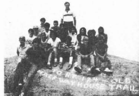
CONQUERING A MOUNTAIN — Teens from the Boston, Mass., church pause on New Hampshire's Mt. Monadnock during their climb Aug. 17.