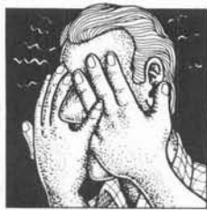
Artwork by Monte Wolverton

What about you? Are you guilty of hiding your problems? Are you too embarrassed to tell your minister that you need help? Are you evasive and deceitful if he questions you? Do you resist the counsel he gives you?