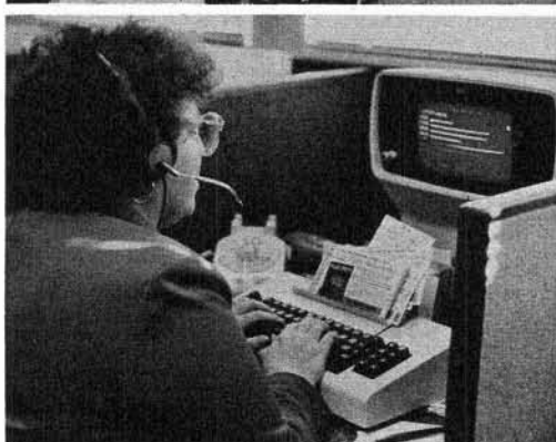
TEXAS FACILITY — Top photo: Employees of the telephone response area in Big Sandy answer calls in response to The World Tomorrow . Above, an operator uses direct terminal entry (DTE) to feed response directly into the Church's computer.