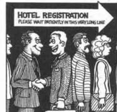
Artwork by Monte Wolverton

Part of love is willingness to serve (Galatians 5:13). Many people serve long hours at the Feast to provide more fully for the rest of us. Sometimes these people can become so busy serving that they can't fully partake of the other aspects of the Feast.