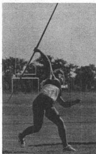
SENIOR GIRLS: JAVELIN

The group spent the afternoon at Fun Mountain water slides and the evening at a dinner dance aboard the MS River Rouge cruising down the Red and Assiniboine rivers. The group left for home July 9.