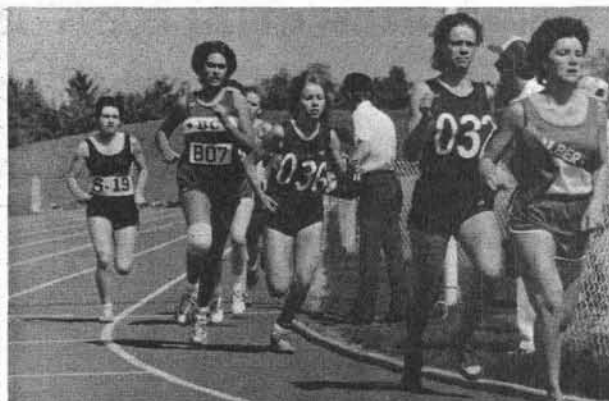
SENIOR GIRLS: 1500-METER RUN