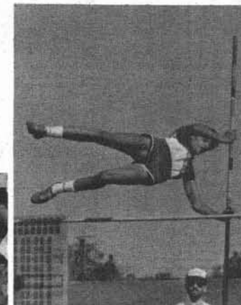
SENIOR BOYS: POLE VAULT