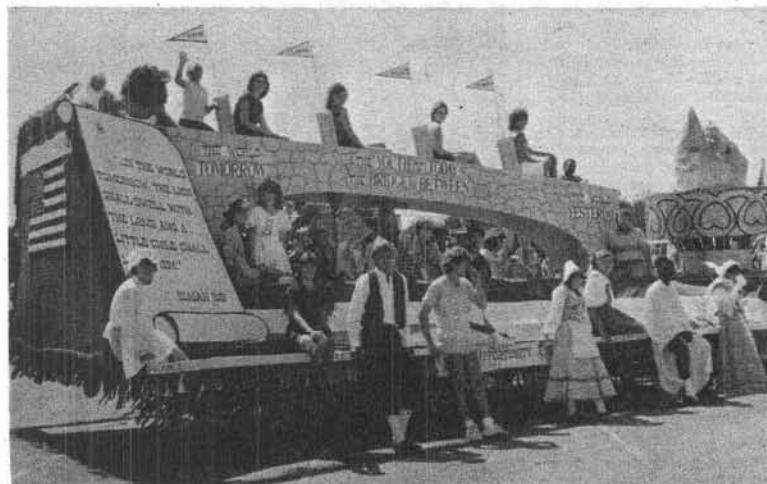
YOU FLOAT — A float built by Fort Worth, Tex., YOU members for the July 4 Arlington, Tex., parade takes second place in the noncommercial category. The float reads, "The Youth of Today — the Bridge Between the World of Yesterday — and the World Tomorrow."