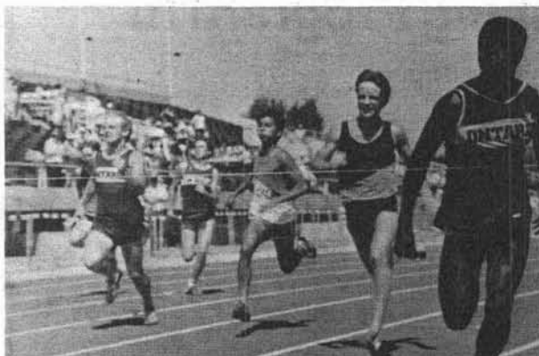
JUNIOR BOYS: 100-METER DASH