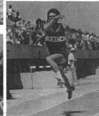
SENIOR BOYS: TRIPLE JUMP