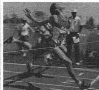
SENIOR BOYS: 400-METER RELAY