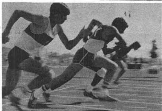
JUNIOR BOYS: 100-METER DASH