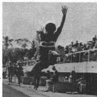
SENIOR GIRLS: LONG JUMP