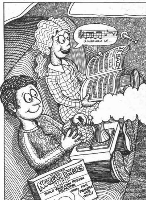
Artwork by Monte Wolverton

Older children can be responsible to help navigate, be designated the trip's official photographer or be put in charge of supervising travel games when necessary. Some ideas are: "I Spy," "Twenty Questions," various word games derived from