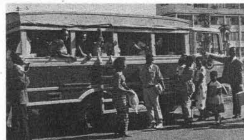
CHURCH TRUCK — Above, brethren living in Ghana step off a truck purchased by the British Regional Office for use by brethren. Besides being used to carry brethren to work on a Church-operated farm, the truck is used as a bus to transport members to and from services. Public transportation there is expensive.