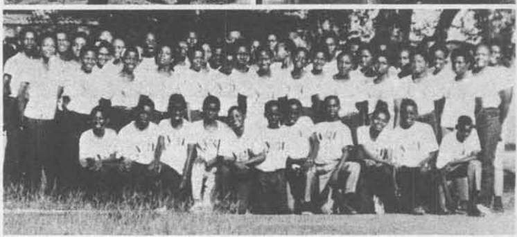
NIGERIAN SUMMER FUN - Clockwise from top: Campers play softball, visit a natural warm spring and gather for a er Educational Program (SEP) in Nigeria Aug. 8 to 14.