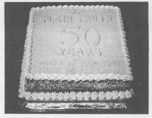
50TH-YEAR CAKE - At golden jubilee celebrations in Liverpool, England, March 10, brethren sampled a cake decorated like the anniversary issue of The Plain Truth .