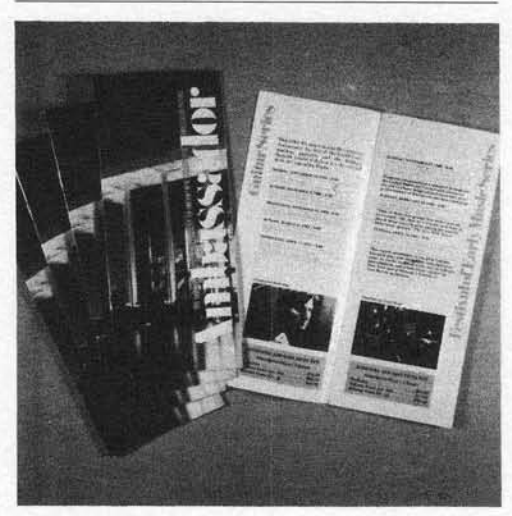
SEASON OF GOLD — The Ambassador Foundation mailed this brochure, which lists concert series for the 1984-85 season, to about 4,000 season subscribers April 11.

The 20 subscription series are Great Performer, Stars of Opera, Great Orchestras of the World, Pi-ano, String Virtuosi, Festival of Early Music, Guitar, Chamber Music, International Chamber Orchestras three Los Angeles Chamber Orchestra series, two Mostly Big Bands series, two Footlight series, three Ambassador Pops series and Keyboard Pops.