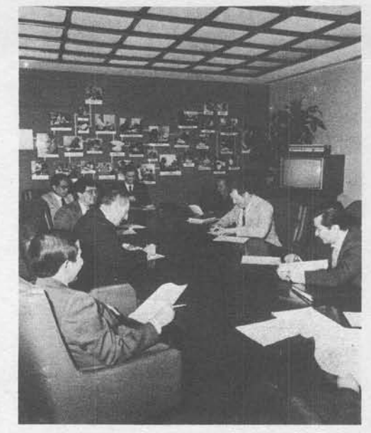
PLANNING MEETING — Representatives of His Majesty King Bhumibol of Thailand and the government of Thailand meet with Plain Truth staff in the Editorial Services conference room in Pasadena April 9. The Thai officials visited Pasadena to advise the work's Media Services Depart-ment about a documentary made in cooperation with Ambassador Foundation that will be used by Thai embassies worldwide.