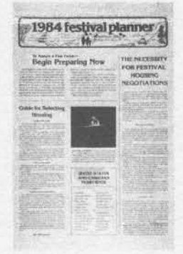
'1984 FESTIVAL PLANNER'

PASADENA — The 1984 Festi-val Planner for the Feast of Taber-