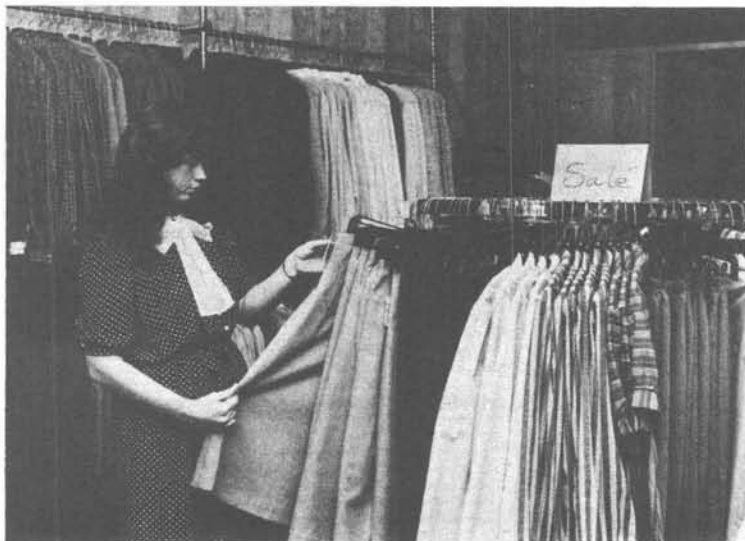
SHOPPING SMART — One way to save money is to look for bargains on the sale racks of shops in your area. Also watch for seasonal sales in your newspaper.

In some countries labor is cheap enough that custom-made clothes may be cheaper than those of comparative quality in the stores. You may want to find out if this is true where you live.