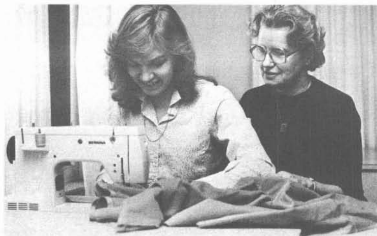
LEARN TO SEW — Women with talent and experience in sewing can serve by teaching skills to those who want to learn.

Quality and attention to detail make the difference in whether your garment looks professional or has the "made by loving hands at home"