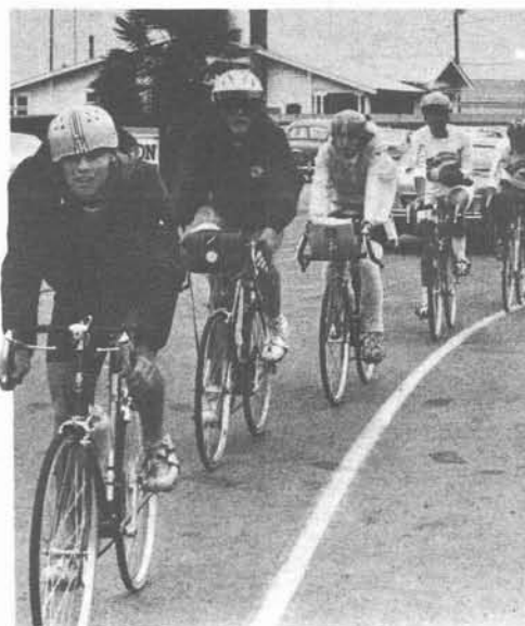
TOURING CYCLISTS — Youth Opportunities United (YOU) members and staff cycle on the South Island of New Zealand, Jan. 6 on a tour of more than 700 miles in the country.

It certainly was a successful tour. But the experience that made "Ambassadors to New Zealand" a memory is participants will not forget was meeting and forming friendships with the 59 other cyclists who were part of our city on wheels.