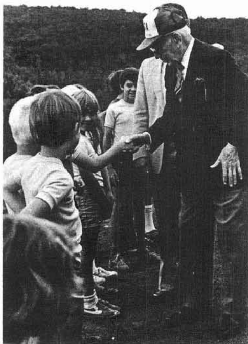
AUSTRALIAN SEP — Pastor General Herbert W. Armstrong meets children of ministers serving at the Summer Educational Program (SEP) at Lake Moogerah, Australia, during his Jan. 12 visit.