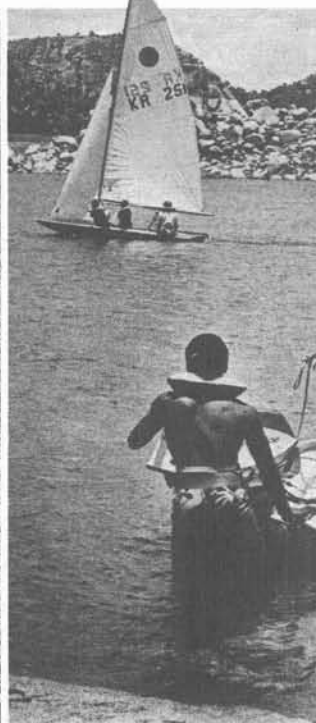
ZIMBABWE CAMP — Clockwise from upper left: Campers climb over a trestle on the obstacle course in the African bush; a sailboat sails on Lesapi Dam; campers canoe (kayak) on Lesapi Dam; and campers on shore prepare for boating. Thirty young people attended the camp, the fifth SEP in Zimbabwe.

the Wellington, New Zealand, airport to the Park Royal Motel. We rode in rows of four abreast in front of and behind the Rolls-Royce in which he traveled.