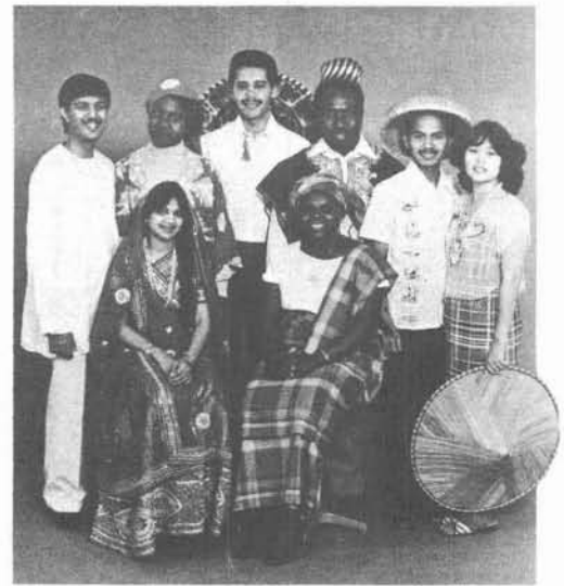
INTERNATIONAL ATTIRE — Guidelines for dress vary from country to country. Seven Ambassador College students and a student's wife model native attire of India, Cameroon, Mexico, Nigeria and the Philippines.

Rather than throw your budget in upheaval by buying a complete wardrobe, remember this: the quality of the clothes you own is more important than the quantity of clothes.