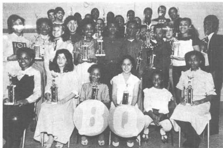
AWARDS NIGHT — Brooklyn and Queens, N.Y., YOU members display trophies and awards they received at a basketball and cheerleading awards presentation evening April 23. (See "Youth Activities," this page.)