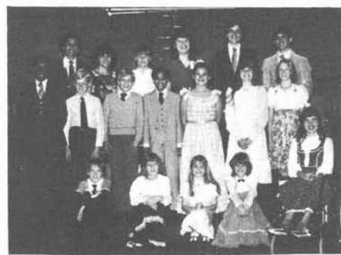
YOUTH RECITAL — Participants in the Garden Grove, Calif., church's youth recital March 6 take time out for a group picture. (See "Youth Activities," page 11.)