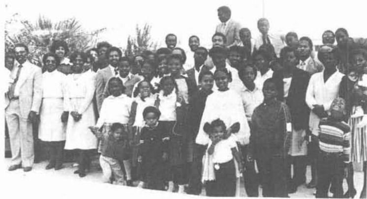
BAHAMAS DISTRICT WEEKEND — YOU members and families attend a district family weekend in Freeport, Bahamas, Feb. 25 to 27. (See "Youth Activities," page 11.)

Members of the BARBADOS Women's Club took a hike March 13. Members of the Spokesman and Graduate clubs were invited to accompany the women. The hike was from River Bay to Cove's Bay, St. Lucy, where the group stopped for lunch and divided into teams of four for a Bible Bowl. Afterward the men and women competed in a lifesaver