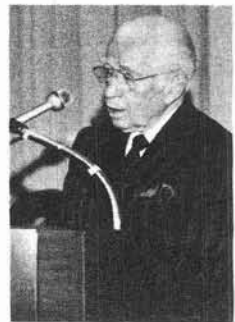
USC ADDRESS — Pastor General Herbert W. Armstrong discusses constitutional law in the Bible and its implications in solving the world's problems March 31.

Well now, in a way you might not understand his prophecy was really fulfilled. In 1926 I was challenged on a point of constitutional law. And at that time I found a great deal about constitutional law in a book that I don't know whether you'll find in very many law libraries. It's a