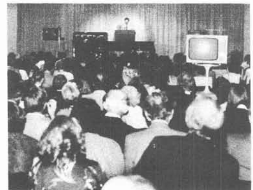
MEDITERRANEAN FEAST — Brethren meet for services at the Corinthia Palace Hotel on the island of Malta during the 1982 Feast. The hotel will again be the site of services for the 1983 Feast.

If you are considering going abroad for the Feast this year, Malta will offer a beautiful and warm environment. Guaranteed are days of hot sunny weather, a warm Mediterranean Sea and all the best of fresh food and fine wines set in an environment of warm, happy, friendly people.