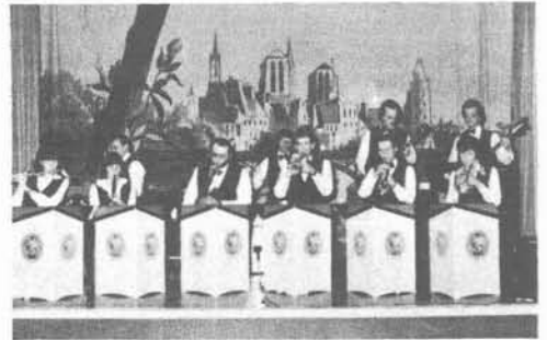
DANCE MUSIC — The newly formed Ambassador Band plays at a combined formal dance of the St. Albans, Borehamwood and Luton, England, churches Jan. 22. (See "Church Activities," this page.)