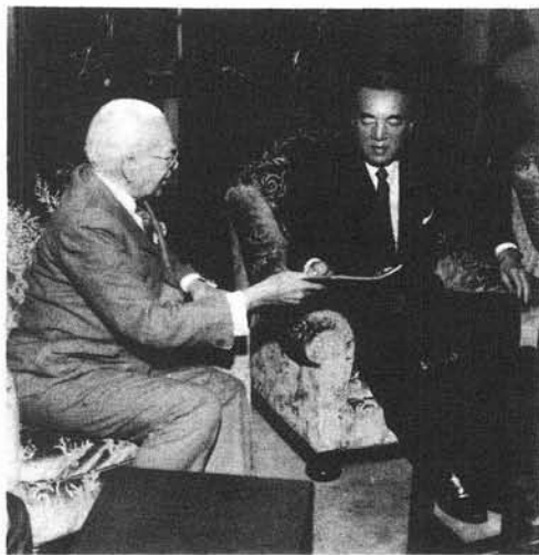
JAPANESE VISIT — Pastor General Herbert W. Armstrong presents a copy of the March Plain Truth to Japanese Prime Minister Yasuhiro Nakasone (right) Feb. 15. (More photo coverage of Mr. Armstrong's Asian trip appears on pages 6 and 7.)