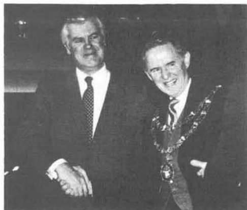
FESTIVAL RECEPTION — At 1983 British Feast sites, city governments will be hosts to civic receptions for brethren, such as the 1981 affair shown above.