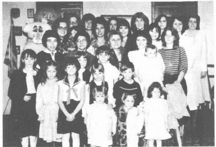
FASHIONABLE FASHIONS — Participants in the fashion show of the Kansas City, Mo., East Ladies' Club Jan. 30 pause for a group picture. (See "Club Meetings," this page.)