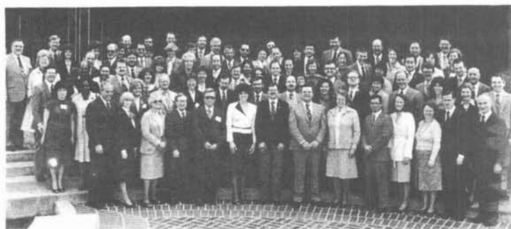
INTERNATIONAL PROGRAM — Ministers, ministerial trainees and wives attending the Feb. 7 to 17 Ministerial Refreshing Program in Pasadena pause for a photo Feb. 10. The session included ministers and wives working in the French area of God's Work.

"Also, some people want to learn more about the Church without