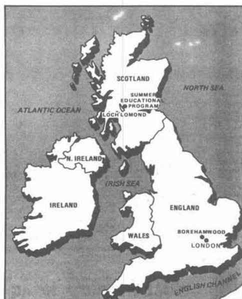
SCOTTISH SITE — Map shows location of the Summer Educational Program (SEP) in the United Kingdom. On the shores of Loch Lomond, 285 campers attended. The location of the new Church offices in Borehamwood, England, is also shown. [Map by Ron Grove]

90 meter low hurdles — Jackie Vickers (ON), 13.9*; 100 meter dash — Donna Yorkie (SM), 14.0; 200 meter dash — Jackie Vickers (ON), 25.6; 400 meter dash — Sandy Zidek (BC), 1:04.6; 800 meter run — Margaret Unger (ON), 2:40.2*; 1500 meter run — Courtney Mottram (AL), 5:25; 3000 meter run — Debbie Altherton (BC), 12:53.8; 400 meter relay — Ontario, 55.7; 800 meter relay — Ontario, 1:57.5.