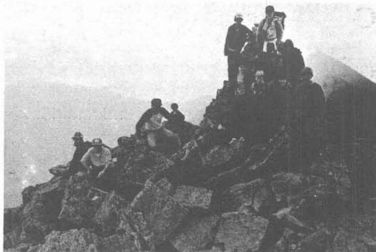
PEAK PERFORMANCE — Pictured above are some of the 26 mountain climbers who reached Baxter Peak during a July 31 to Aug. 3 camp-out of Concord, N.H., and Portland and Bangor, Maine, churches. (See "Church Activities," page 4.)