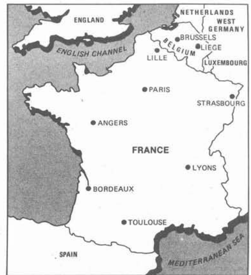
FRENCH-SPEAKING CHURCHES — The map above shows cities where God's French-speaking churches meet in France and Belgium. The Strasbourg, France, church will begin by mid-August.

Tradition has it that Cullera is the site of the ancient township of Sicania, about which praises were sung by the Greek poet Homer. Rich in archaeological history, Cullera offers the remains of a 4th century B.C. Iberian town, an Arabic