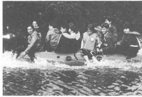
RIVER RIDE — Croydon, England, YOU members ride in dinghies on the River Medway during a May 23 outing. (See "Youth Activities," page 11.)