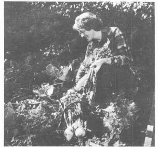
GREEN THUMB PAYS OFF — Planting a garden can cut costs in a family food budget. Homegrown products are often more nutritious, as commercial vegetables are picked before they are ripe.

It takes time to start a new business, but doing quality work quickly will pay off in the long run.