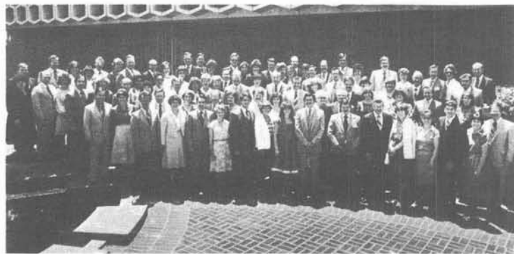
REFRESHING PROGRAM — Ministers and wives participating in the June 28 to July 8 Ministerial Refreshing Program gather for photograph on the Pasadena Ambassador College campus July 1. Ministers from New Zealand, the Philippines, Singapore, South Africa, Canada, England, West Germany, Australia, the Netherlands and the United States participated.

"While some of the regional offices concentrate their Plain Truth distribution in certain areas, we have scattered distribution worldwide," the evangelist continued. "We distribute thousands of copies of the French Plain Truth in the United States, Canada and the