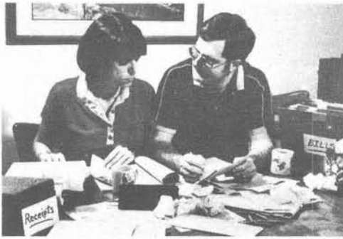
POSITIVE PLANNING — Planning a budget together resolves many financial problems faced by couples. Living within a family's means is important.