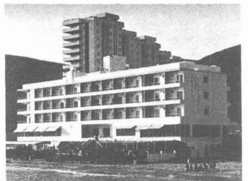
SPAIN FEAST — Brethren attending the Feast in Cullera, Spain, will meet and be housed in the beach-front Hotel Sicania, pictured above. Services will be conducted in Spanish only.