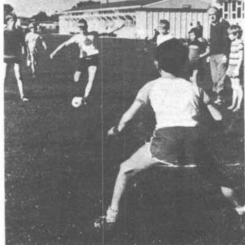
SOCCER FUN — Children play soccer at Auckland, New Zealand's district family weekend June 6. (See "Youth Activities," page 10.)

District 13 YOU track meet was sponsored May 23 by the BINGHAMTON (See CHURCH NEWS, page 10)