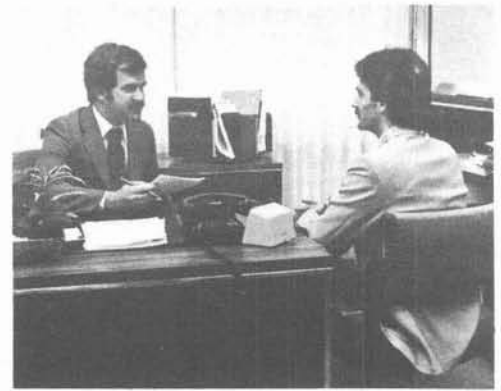
JOB SEARCH — Preparing yourself before a job interview can lessen anxiety and increase your chances of obtaining a job.

"So they don't starve, but they don't have much left over for bus (See RECESSION, page 7)