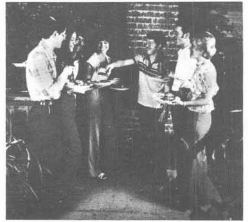
BACKYARD BARBECUE —A get-together with other brethren is an inexpensive means of entertainment. Have each person or couple bring a favorite dish.

• Outings. Fishing, bicycling, roller-skating, visiting mountains, beaches or parks—these activities are certainly less expensive than attending a professional sports event