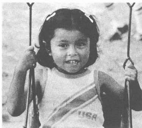
SWINGTIME — A youngster enjoys a children's party at the Festival at Oaxtepec, Mexico.

tomorrow. With temperatures in the 80s (Fahrenheit) Feastgoers enjoyed beach games on Golden Bay Beach, a day trip to Gozo Island and a guided tour of Malta.