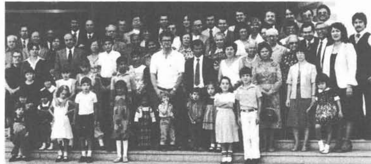
FEAST IN SPAIN — Brethren attending God's Festival in Cullera, Spain, assemble at the Hotel Sicania for this group photo. More than 60 brethren attended the site, now in its second year.