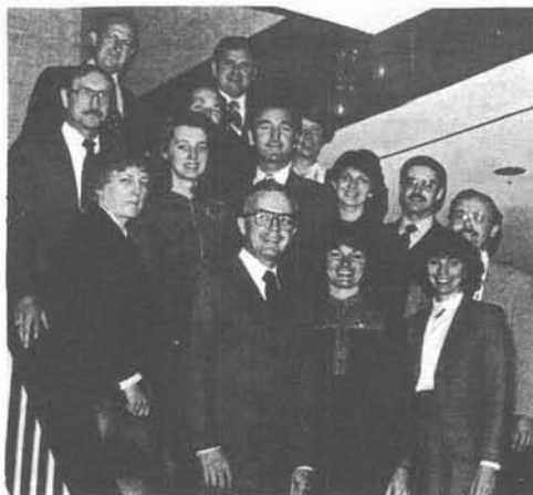
WORKING SERVANTS — Ministers, ministerial trainees and wives pause during God's Festival at Charlottetown, P.E.I.