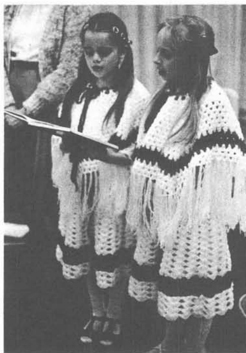
YOUNG VOICES — Two Feastgoers add their voices to a song service at the Rabat, Malta, Feast site.

REGINA, Sask. — The power of Herbert W. Armstrong's satellite messages brought favorable comments from more than 1,700 brethren assembled at the Saskatchewan Centre of the Arts here. The Leader-Post , a Regina newspaper, ran a news release about the Festival, but left out the name of the Festival and the fact that Jesus Christ observed it in the New Testament.