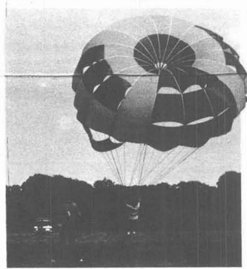
UP, UP AND AWAY! — A member enjoys paragliding at the annual Maidstone and Croydon, England, camp-out Aug. 28 to 31. (See "Church Activities," this page.)