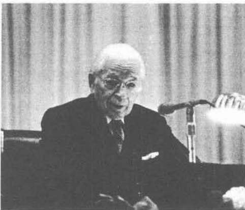
FEAST SERMON — Pastor General Herbert W. Armstrong addresses brethren at the Big Sandy Festival site Oct. 17. Mr. Armstrong also spoke in Pasadena and St. Petersburg, Fla.

"Instead of declaring war," Mr. Armstrong remarked, "he declared peace... and now started to dedicate his life to peace, and indeed, he gave his life for peace.