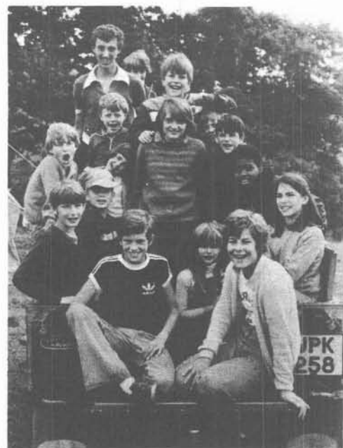
CAMP-OUT — Youths of the Maidstone and Croydon, England, churches pause during the annual church camp-out Aug. 28 to 31 on a farm in south-eastern England. (See "Church Activities," this page.)

A men's night culminated the current year of the Lady Ambassadors Club of BELLEVERNON , Pa., Sept. 20. Before the dinner meeting some of the ladies and their husbands toured Linden Hall, an estate built before World War I. Fol-