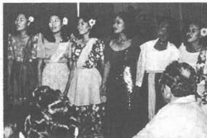
BAGUIO CITY, PHILIPPINES