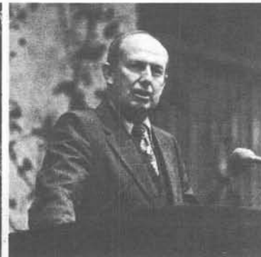
MOUNT POCONO, PA.