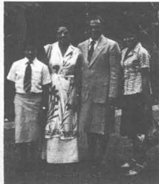
PACIFIC HARBOUR, FIJI