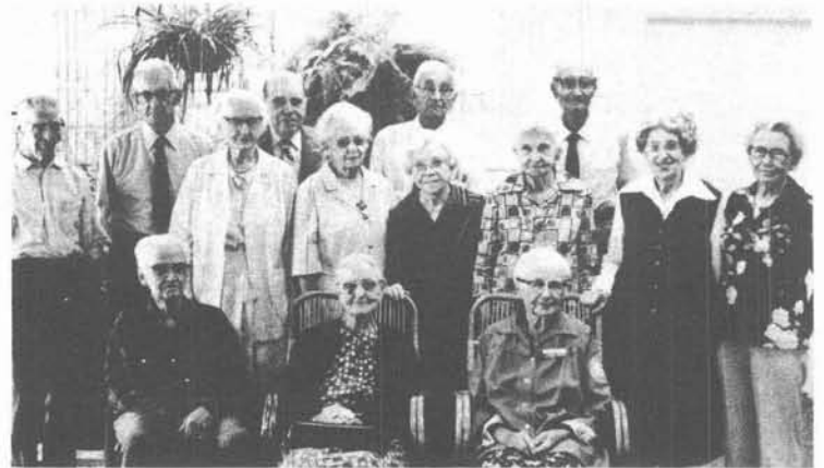
80 PLUS — Springfield, Mo., members 80 years old and older pose for a group picture at a meeting of the 60 Plus Club Sept. 13. (See "Senior Activities," this page.)