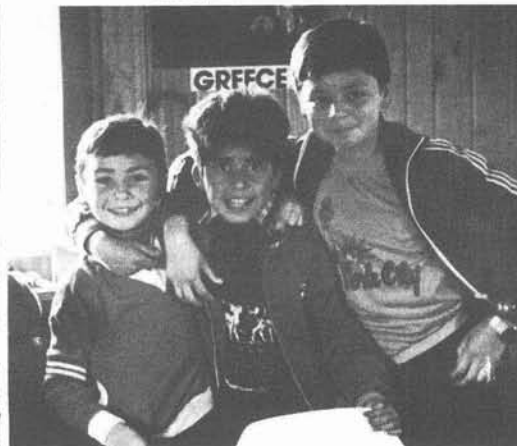
LAGO PAPEL CHILE