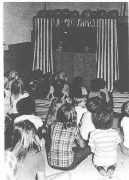
PUPPET SHOW — Youths enjoy a puppet show at a children's party in Raleigh, N.C., Sept. 6. (See "Youth Activities," this page.)