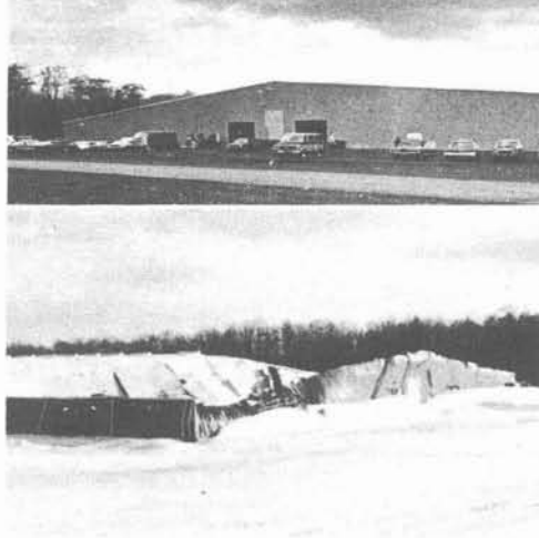
BEFORE AND AFTER — Members exit the repaired Church building in Mount Pocono, Pa., after 1981 Feast services, top photo. Above, the building following the January, 1978, storm.