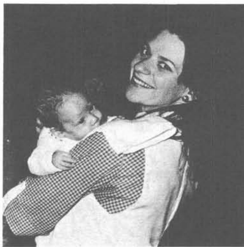
FESTIVAL OF REJOICING — A Church member and infant share a moment after services in Hobart, Australia.

Beautiful weather prevailed for most of the Feast as 722 brethren gathered for the Feast here. Many expressed their appreciation for sermons and activities throughout the eight-day period.