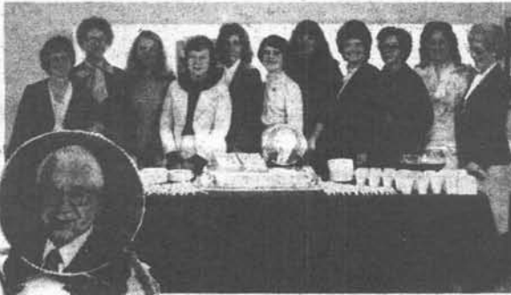
OKLAHOMA CITY, OKLA.

Celebrating the end of the 21-month lawsuit against the Worldwide Church of God, brethren around the globe gave thanks to God, fellowshiped and feasted on a special Sabbath of Thanksgiving Nov. 15, proclaimed by Pastor General Herbert W. Armstrong. Church members dined on roast turkey, venison, elk and moose; lined up for chicken and potluck dinners; sampled beef stew and chili, tasted wines, fruitcakes and ice cream; and enjoyed costume parties, special choral music and inspiring sermons.