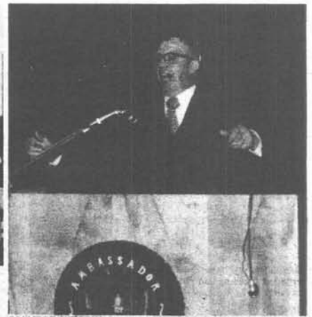
CALVERT CITY, KY.