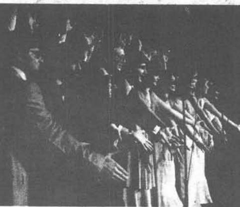
STAGE PERFORMERS — Ambassador students perform in unison during the college's Thanksgiving dance Nov. 23 in the Student Center.