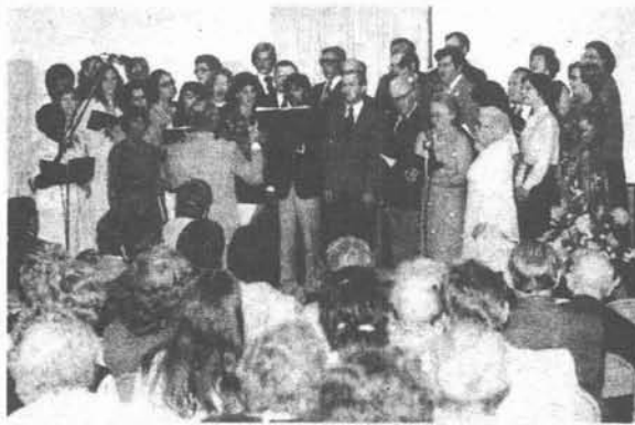
ST. PETERSBURG, FLA.

As members around the world gave thanks to God, munched on cookies and cake, and spent hours in fellowship, the reports indicated that God's Church is united, looking forward to doing its part in completing the great commission.