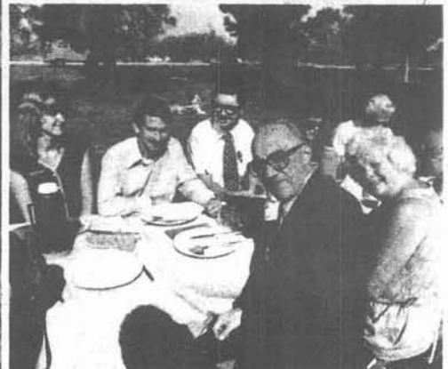
LONG BEACH, CALIF.