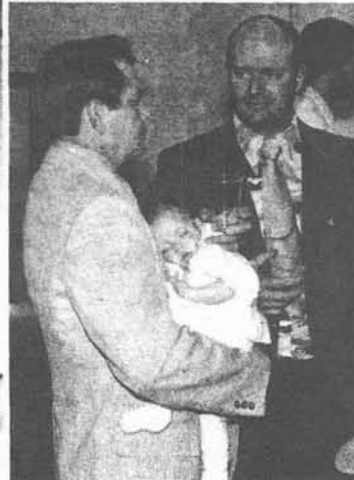
RAPID CITY, S.D.