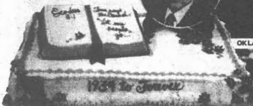
OKLAHOMA CITY, OKLA.