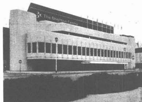
FESTIVAL SITE — The Brighton Centre, a convention facility in a resort area on England's southern coast, is the location for services of the 1980 Feast of Tabernacles for members in the United Kingdom and Ireland.