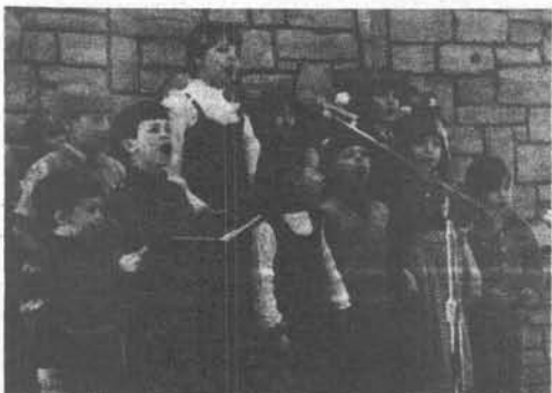
PRAISES TO GOD — The little children sing at the Mount Pocono, Pa., Sabbath services March 1. (See "Church Activities," this page.)