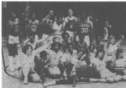
WINNING SMILES — The Oakland, Calif., Tigers, left, express their happiness after winning the YOU district basketball competition in San