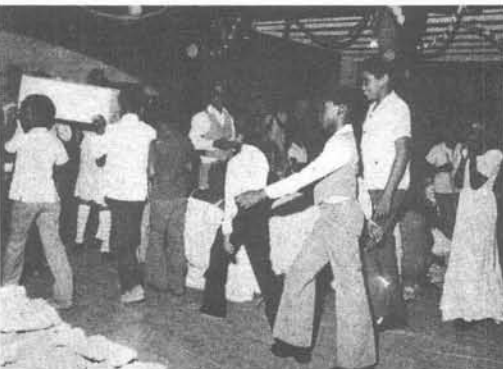
members march around the walls of Jericho in their play. (See "Church Activities," this page.)