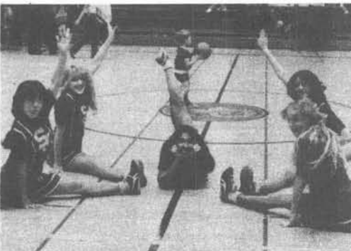
Jose, Calif., Feb. 2 and 3. San Jose's cheerleading squad, right, tied for first place in cheerleading competition. (See "Sports," this page.)

Sunday morning was time for the basketball tournament. The junior division was won by Rome and the senior by Chat-