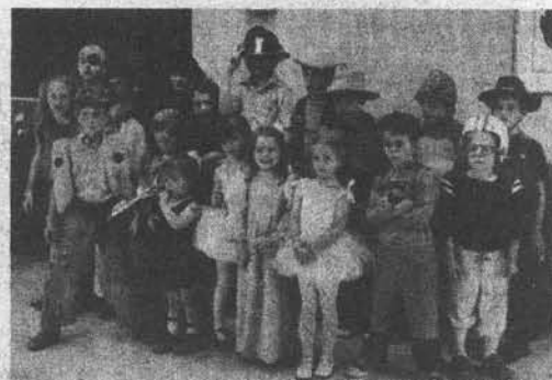
FAVORITE COSTUMES — Wearing their favorite costumes, children of the Rome, Ga., church pose for the camera at their costume party May 20. (See "Youth Activities," this page.)