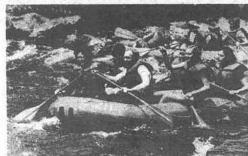
RAPID TRANSIT — Members of the Philadelphia, Pa., and Hammonton and Trenton, N.J., churches challenge the white water on the Lehigh River in the Pocono Mountains May 28. (See "Church Activities," this page.)