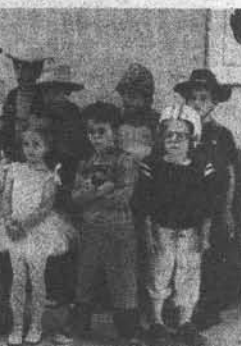
FAVORITE COSTUMES — Wearing their favorite costumes, children of the Corpus Christi, Tex., church pose for the camera at their costume party May 20. (See "Youth Activities," this page.)

ren were hosts for softball and volleyball tournaments May 27. Eight Texas teams participated in the softball tournament, with the first-place trophy going to Austin, second to Houston North, third to Houston West and fourth to San Antonio A. Other teams participating were Harlingen, Houston East and San Antonio B.