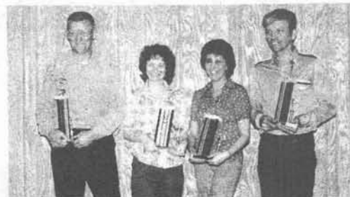
BOWLING CHAMPS — Members of the Long Island, N.Y., A bowling team display the trophies they won after defeating the Manhattan, N.Y., A team for the championship in the Philadelphia, Pa., invitational handicap bowling tournament April 1. (See "Sports," this page.)