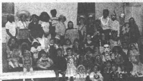
COSTUME PARTY — Children ages 3 through 13 of the Montgomery, Ala., church model the costumes they conjured up for the children's costume party March 17. After refreshments and some magic tricks, the children viewed several Laurel and Hardy and Little Rascal movies.

Reports for "Local Church News" must be postmarked no later than 14 days after the date of the event reported on and be no longer than 250 words. Reports lacking the date of the event cannot be published.