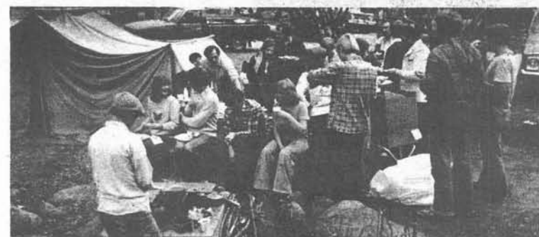
CLUB CAMPING TRIP — A group of Ambassador College students take a meal break on a weekend camping trip to Sequoia National Park.