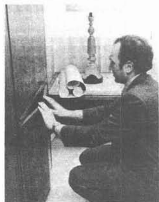
EXECUTIVE SUITE — Above: An attorney for State of California searches for records in the executive office suite in the Church's Hall of Administration. Below: A locksmith changes the lock on a door to the Church's accounting department to safeguard records.

I tried to call the police immediately. I said: "There is a break-in. Get someone down there." He said: "Oh, I know you people are having trouble over there. But I don't think I want to go." Then I said: "Look, I happen to be the secretary of that Church and I'm the attorney for it, and I'm telling you to get down there." He said, "Well, I know about the trouble." So I said: "Look, I don't care what trouble you've heard about. Does that make you fair game for a bunch of burglars?" He replied: "Well, okay, I'll send somebody down. But if I send somebody down and there's no break-in — that they went in with a key — no literal break-in, I'm not (See EXCERPTS, page 13)