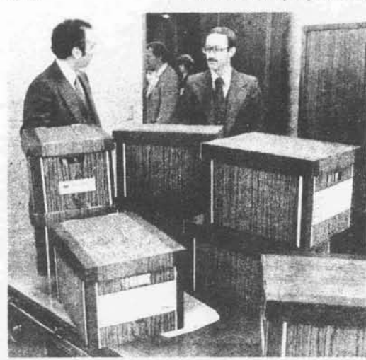
SEIZED FILES — Attorneys for the State of California, left, and the Worldwide Church of God watch over some of the files seized by the State in the executive suite of the Church's Hall of Administration.

and denied Christ three times, and even after he was ordained and was the leading apostle in the New Testament Church, he and Paul had this confrontation when Paul confronted him over his lack of understanding of the racial issue that God was admitting all freely into God's Church in spiritual fellowship. Then Paul and Barnabas had a confrontation and the contention was so sharp between them that they worked separately for a while, and yet still cooperated, and wrote lovingly. Obviously they were in the same Work. They didn't start different churches. They didn't have a "Paul Church" and a "Barnabas Church."