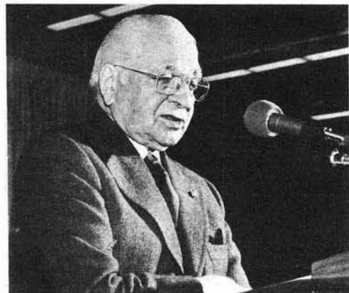
IN MILWAUKEE — Herbert W. Armstrong addresses a combined-church service in Milwaukee, Wis., Feb. 5.

TORONTO, Ont. — Garner Ted Armstrong traveled to Toronto to speak twice, Feb. 12 and 13, to campaign crowds of 2,518 and 2,458 (1,100 and 1,350 nonmembers) and while here addressed a combined Church congregation of 2,250 the Sabbath of Feb. 12 and was to open a three-day conference of Canadian ministers before heading back to Pasadena.