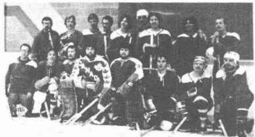
WINNING TEAM — The Toronto Tontos were the victors of a five-hour hockey tournament Jan. 2 against four other Canadian teams. (See "Hockey Spectacular," this page.)

Sunday featured a 12-mile canoe (See WRAP-UP, page 15)