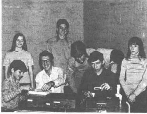
SOUND OF MUSIC — Teenage disc jockeys feature songs especially for the older set at a teen-sponsored social in Barrie, Ont. (See "Cross-Country Skiing," this page.)