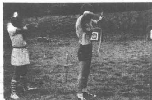
SEP TRAINING — New Zealand SEP campers learn archery, above, and riflery, below.

The 10-day program provided many New Zealand teenagers with opportunities to acquire and develop skills and creativity and the chance to live a full, exciting, balanced life of social, cultural and sporting activities.