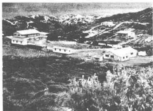
CAMP SITE — This complex at Binningup in Western Australia was the site of a camp for youths of the Perth church.

They were up at 6 a.m., ready to run half a mile up the beach and back, have a quick swim, clean up the dorms and eat breakfast. Then came archery, volleyball and other sports, an instruction class, morning tea, a swim, beach-buggy and bike rides