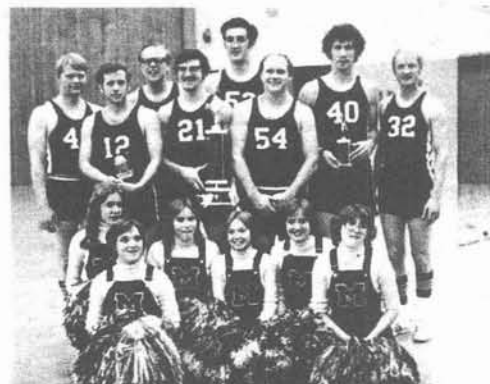
TWIN CITIES WINNERS — The happy Minneapolis basketball team and cheerleaders display their trophies after winning the Twin Cities Invitational Tournament. (See "20-Game Schedule," this page.)

Team sportsmanship plaques were presented to the Minneapolis men and the Des Moines women.