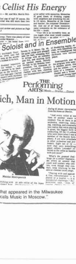
that appeared in the Milwaukee calls Music in Moscow."

They are the only ones who still have more than two years to live.