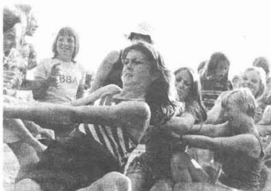
MINI-OLYMPICS — Sports activities at the Warwick, Queensland, SEP culminated in tugs-of-war for both boys and girls, left photos. Below: Boys under 12 sprint in mini-Olympic competition.