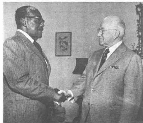
BAHAMIAN VISIT — Herbert W. Armstrong meets Sir Milo B. Butler, governor-general of the Bahamas, during his week of activities before his campaign in Nassau, which began Feb. 20.

dinner by the Bahamian Institute of Architects. "Mr. Armstrong decided he would stay and speak very briefly because he did not want to give away the impact of his message which he was reserving for Friday and Saturday. Consequently I remained and spoke for 20 minutes or so about the relationship of the Church to the foundation, the reasons for our presence in Nassau, as well as our plans for the future."