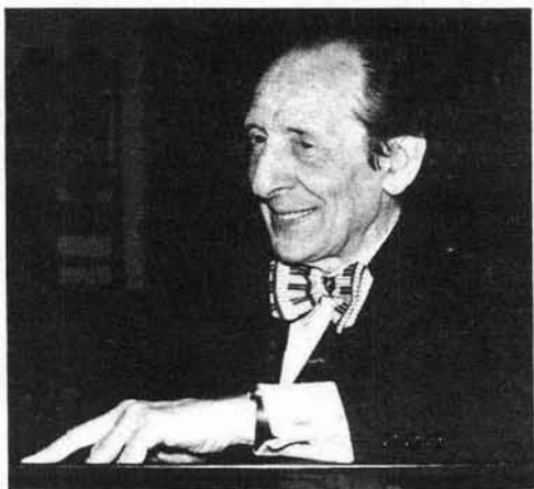
PIANIST — Vladimir Horowitz presented his first West Coast concert in 23 years at the Ambassador Auditorium in Pasadena Feb. 22. The capacity audience of 1,262 gave the piano virtuoso a standing ovation. Mr. Horowitz played a second time in the Auditorium Feb. 29.