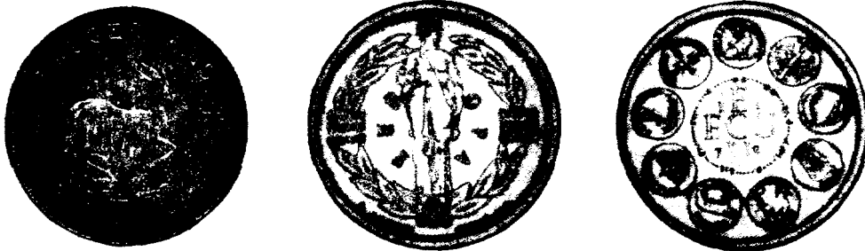
The Krugerrand (left) and the ECU

"Highly important, but little publicised was the announcement recently that the European Economic Community (EEC) would issue a gold coin, the ECU (pronounced Eh-Cue), marking the first coined money of the European Monetary System and the EEC.