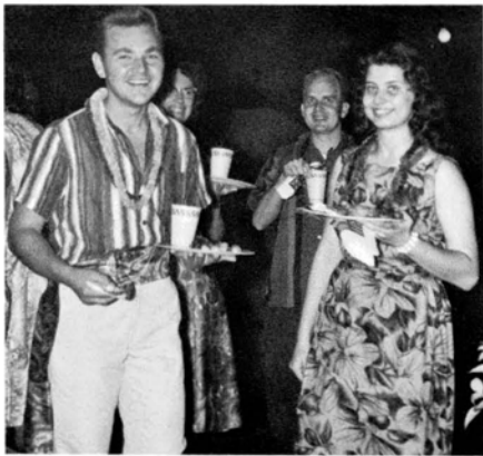
HAWAIIAN —Theme of Hoolaleah is expressed in costumes of young people. Smiles show everyone had a happy time.

Before this activity was over, plans for the really BIG Dinner and Dance were under way. The planning committee is scouting the entire Southern California area for just the right place to fit the royal and regal theme of this much-looked-forward-to formal occasion. This dinner-dance will be the last and biggest activity for 1965 before launching into the exciting program for 1966!!!