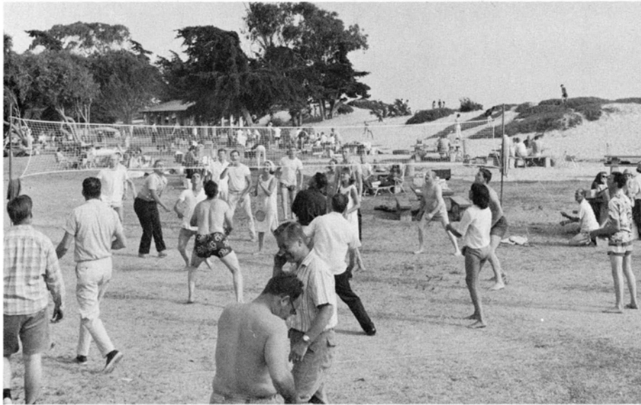
VOLLEYBALL —Members from Santa Barbara and Glendale enjoy vigorous game of volleyball during outing at Carpenteria State Beach.