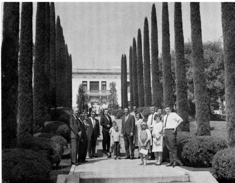
CAMPUS TOUR —Standing on the walkway to Ambassador Hall, Glendale members pause for a moment on eye-opening tour of college campus.