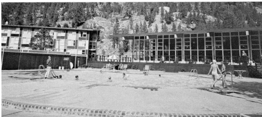
ABOVE—The heated swimming pool by the side of the cafeteria is a spot for happy children.