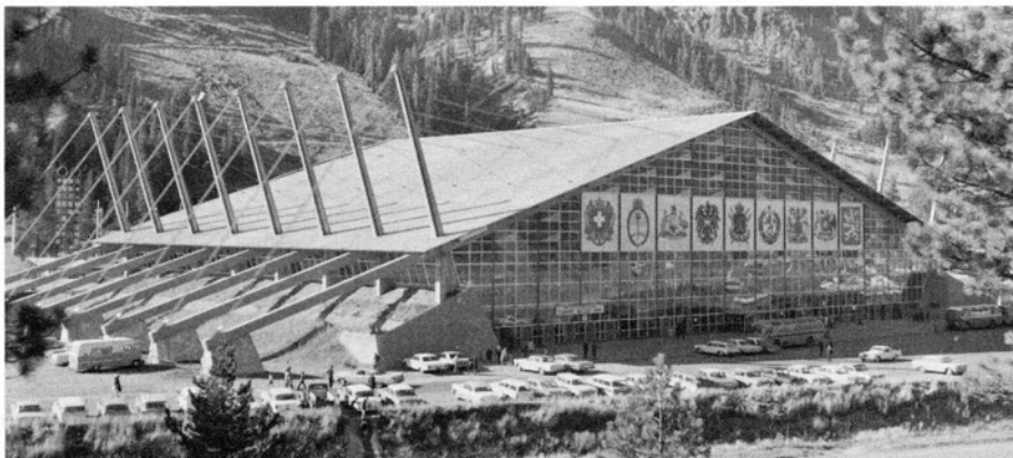
BELOW—Large fur trees and rugged mountain slopes enclose the place where God has placed His name.