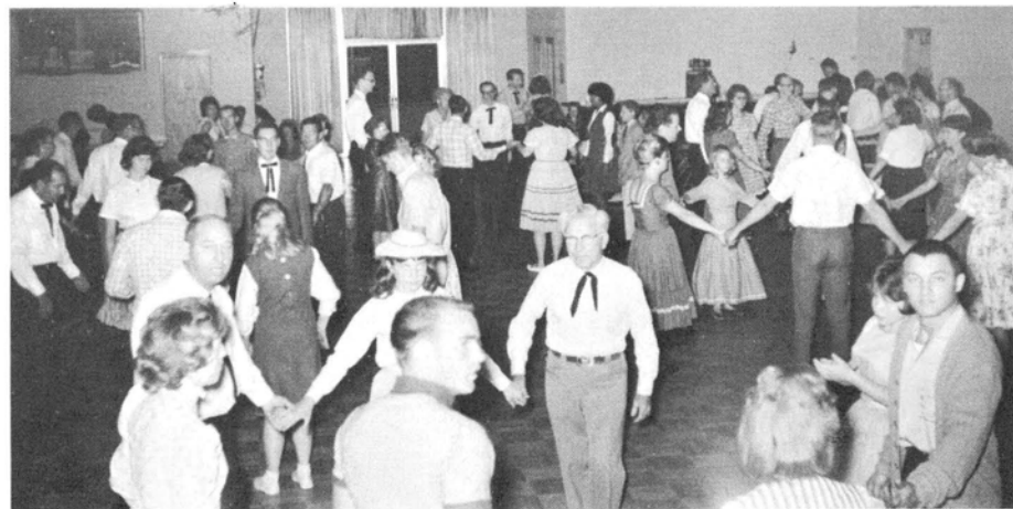
FAMILY DANCE —With derby hats, red armgarters, bonnets and bustles, the Fontana members enjoy a "Gay Nineties" square dance.

It truly was a GAY Nineties night of food, fellowship and fun!