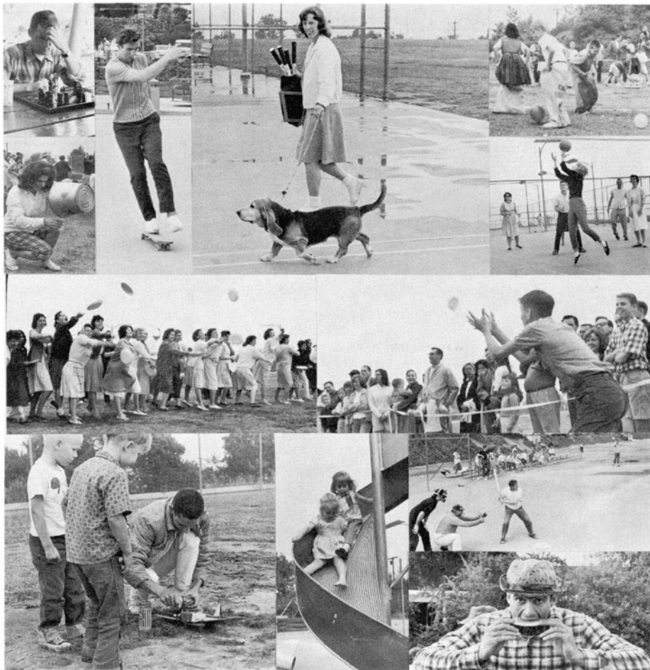
PICNIC PANORAMA—This composite of the various activities at Pasadena social illustrates the "Something for Everyone" theme.

The main meeting hall seats over 400 and yet is compact and spacious all at once. All of this costs no more than the old hall for our 270-plus people. When God blesses us, He does it big!