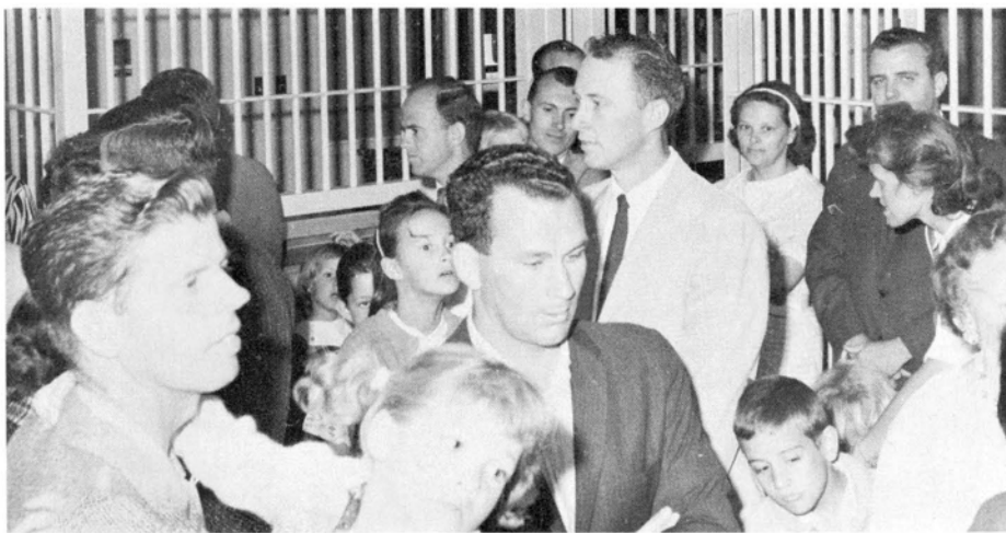
JAILED CLUB —The Glendale Spokesman Club, with families and guests, find themselves locked up behind bars during tour of Glendale Police Department.