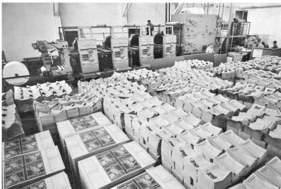
MAIN PRESS —Key to publishing division's new expansion program is this giant web press. Here you see part of June PLAIN TRUTH in foreground. WHO WILL RULE SPACE? was first full-color booklet printed on the press.