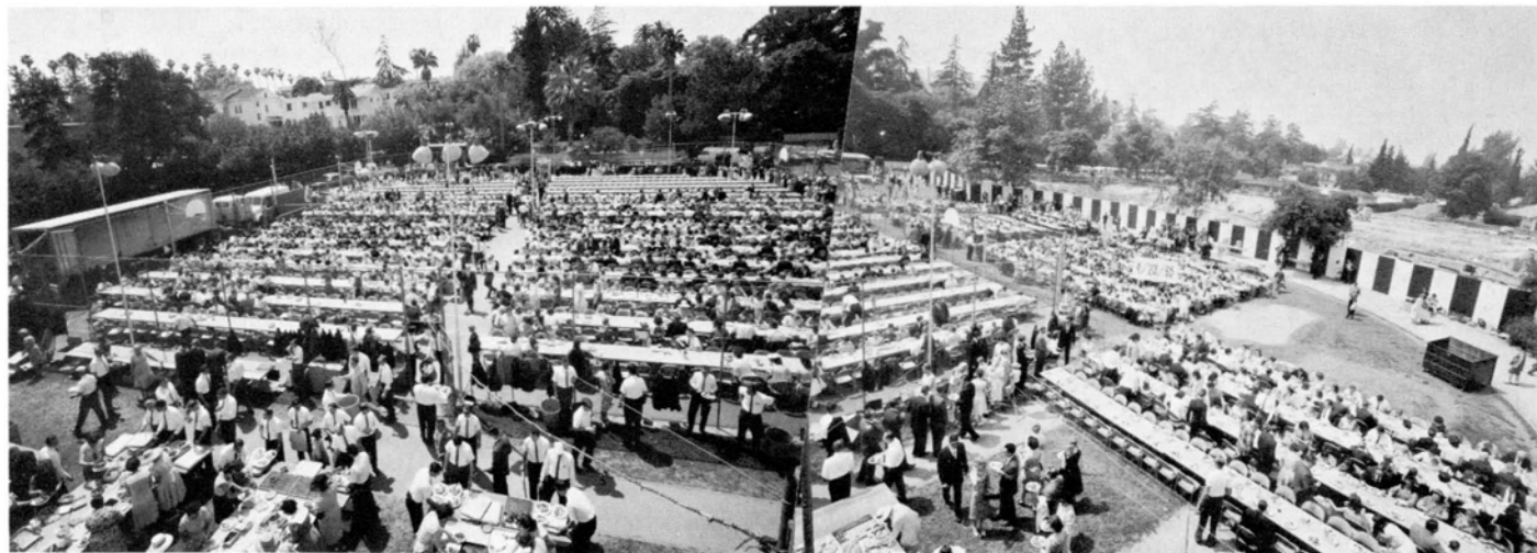
PANORAMIC VIEW —This composite of two photos gives you a revealing look at 3,000 headquarters area brethren feasting on the Ambassador College tennis courts, during recent holy days. Notice the large black

and white fence at right of photo. Behind this area the new college Dining Hall is under construction.