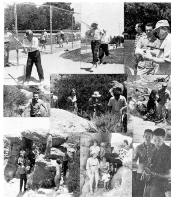
FUN-FILLED DAY —Single people enjoy all-day outing at Chatsworth Park.

Start to plan ahead now for the Feast of Pentecost, and make it our best feast ever!