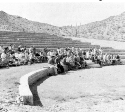
OUTDOOR SPOKESMEN —Phoenix men compete with wind and distance in unusual circumstances during recent club meeting.

While much of the nation shivered in rain, sleet, and snow, the Phoenix brethren basked (and burned) in the bright Arizona sun as the Phoenix Spokesman Club held its first outdoor meeting. Because of the adequate room and facilities, the entire Phoenix Church was invited to observe the meeting. A potluck lunch and picnic for everyone followed the conclusion of the Club session.