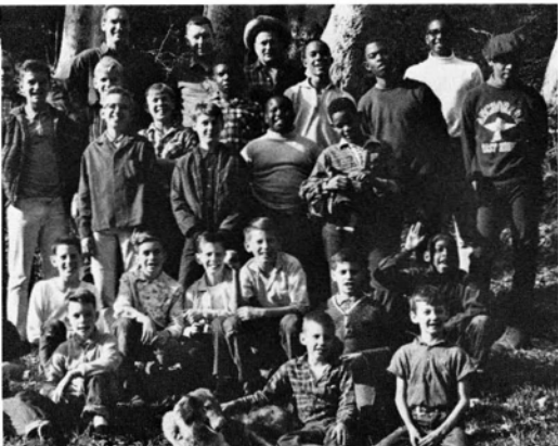
ALL SMILES—Recent outing produced these big smiles by Los Angeles Boys' Club members.