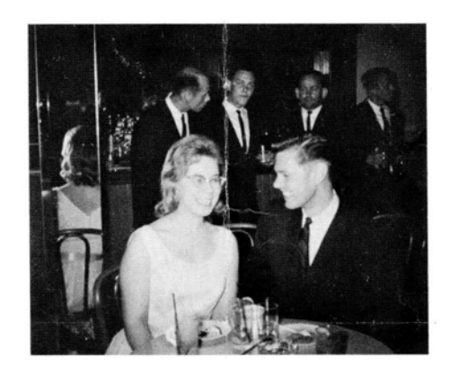
This single-set dance was a success!