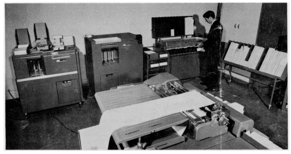
Streamlining through efficiency, speed, accuarcy and multiplicity of purpose; these latest electronic additions to the Filing Department are condensing man-hours into electronic seconds. See these fantastic machines on your tour through Ambassador College Press.