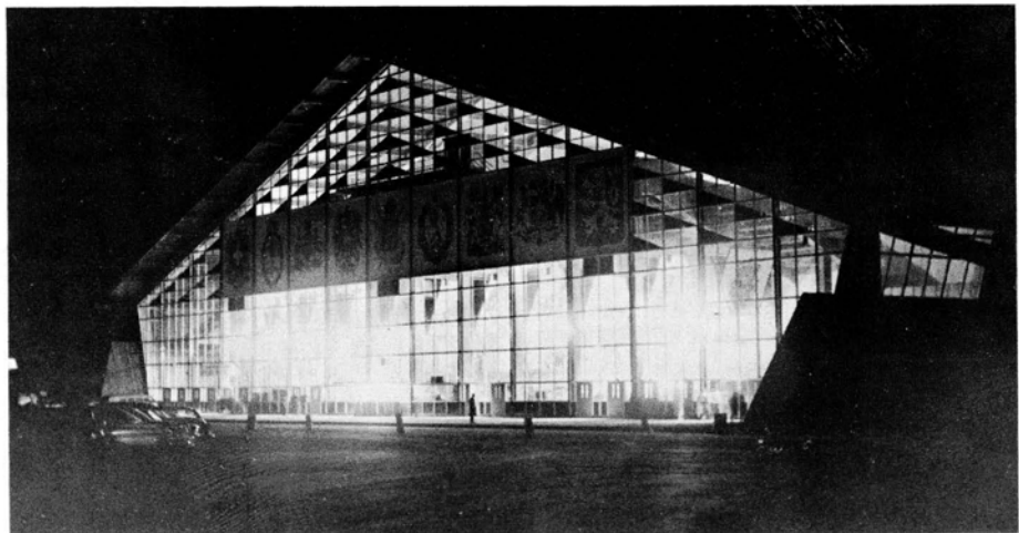
Blyth arena -- So long 'til next year.

We could see just a part of the beautiful garden that God has given (cont. on page 4)