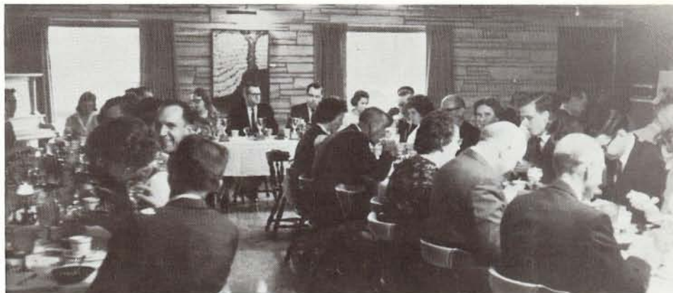
Wichita Spokesmen meet and eat!

We certainly hope that he will return soon and be with us again.