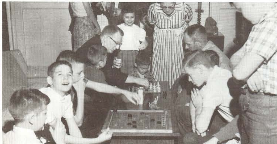
Fun and games!

The trouble with dropouts is not that they cannot see the handwriting on the wall, but that they cannot read it.