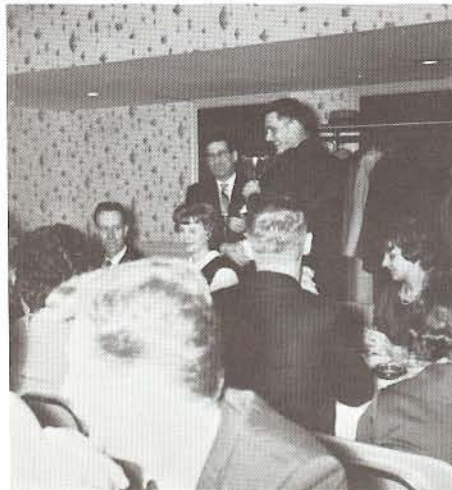
Most effective speaker.

Opening night "jitters" if present at the start, soon vanished in the warm glow of friendly, happy fellowship. It is from such association as this, that the words Christian and fellowship are joined together and take on a new, truly meaningful significance.