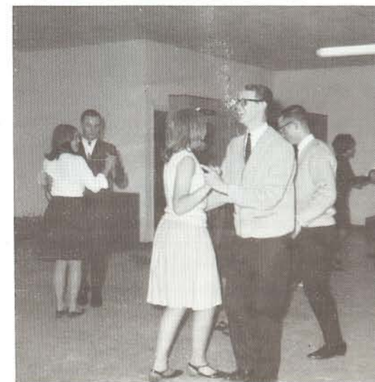
Soft shoe shuffle.