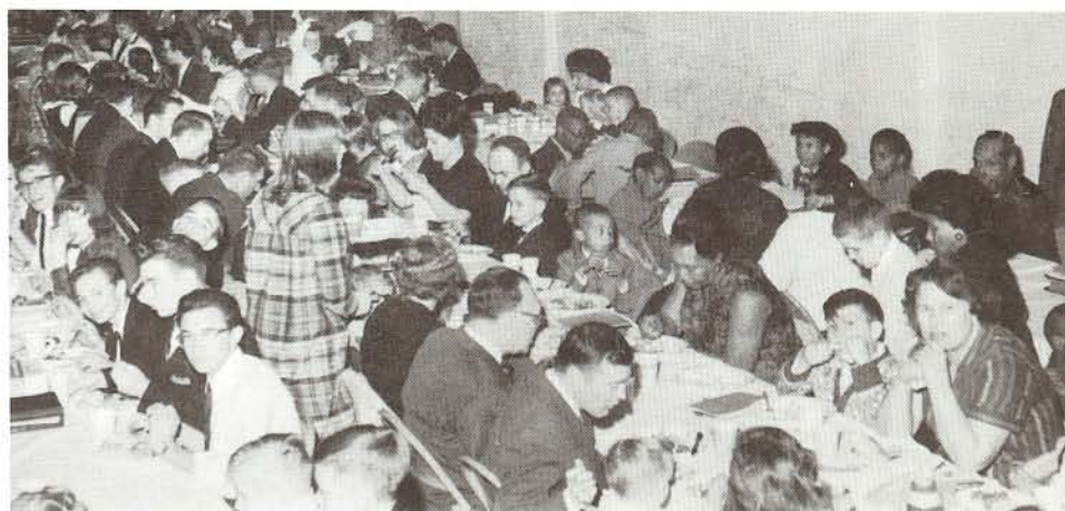
Enjoying the physical food.