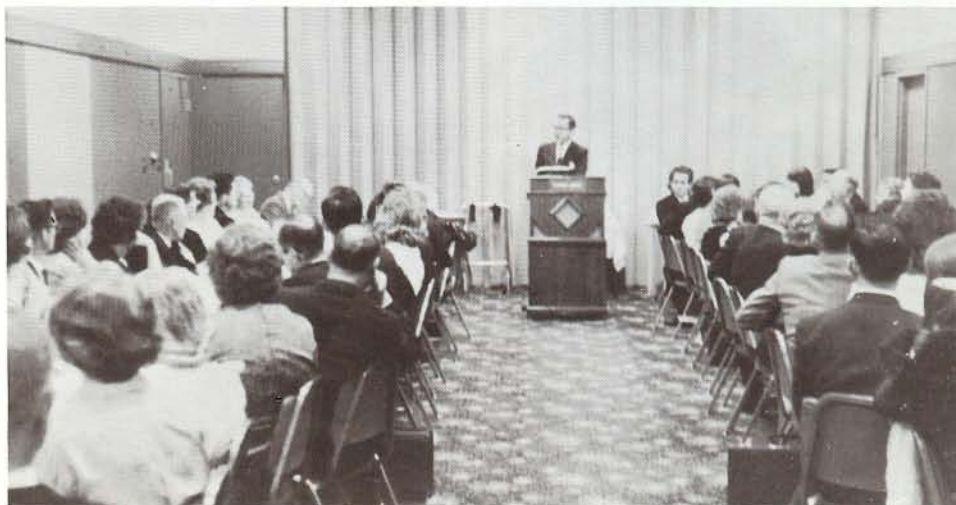
Evaluating the Saturday Nite Club.

The birth of each new nation somehow finds Uncle Sam the babysitter.