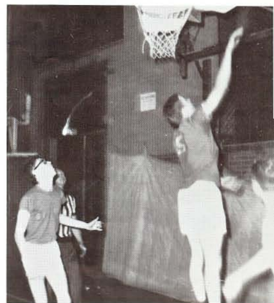
A one hander!

A generation ago most men who finished a day's work needed rest; now they need exercise.