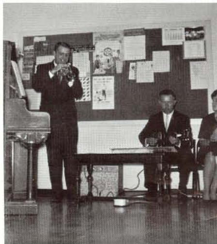
A hot combo!

It was probably our last social for this season. But there are many diversions to help us lead a balanced life.