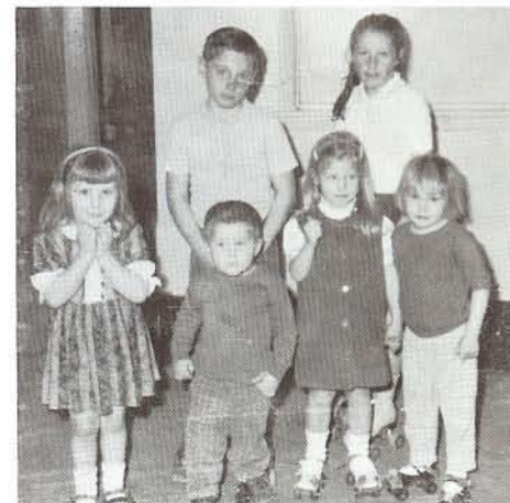
Ready to roll.

We were thankful we have this opportunity for exhilarating exercise, amusement, and fellowship.