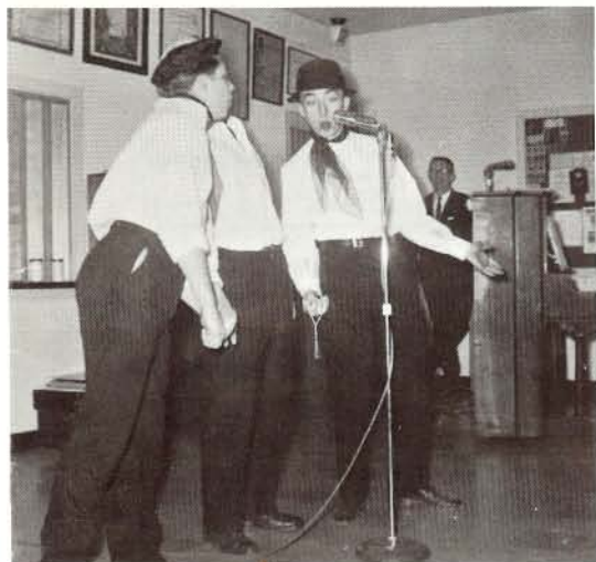
Those guys again!