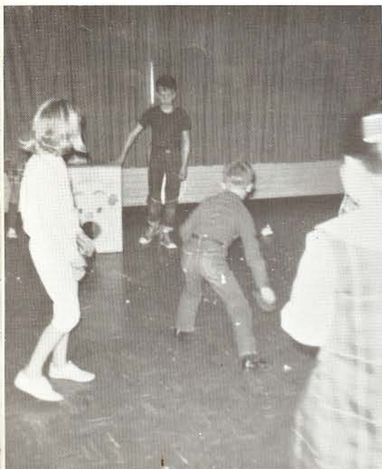
"Bean bag bowling."