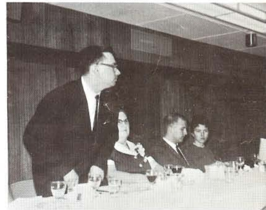
What did he say?