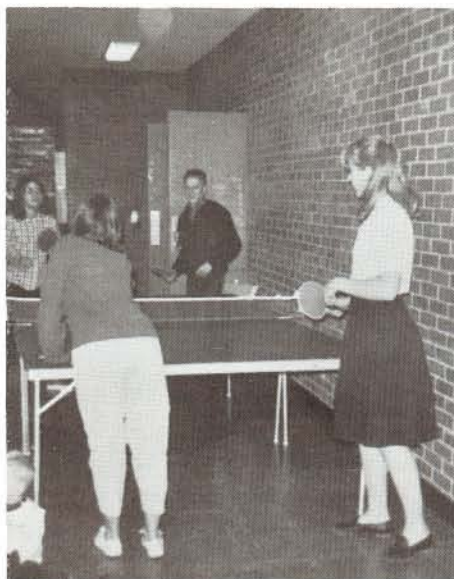
Ping for serve.

After the show, various games were set up for the children, and they thor-