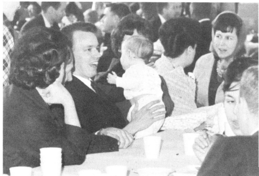
Babies certainly make me happy.