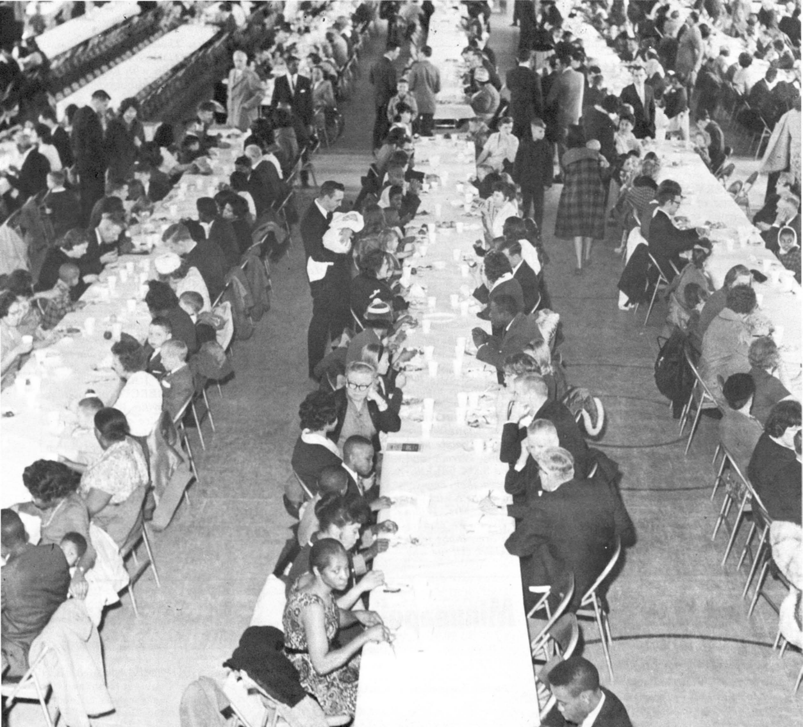
Above: Top efficiency and organization—over 1300 people fed at the Gary Armory in less than an hour.