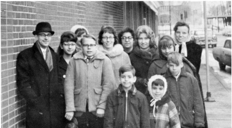
Chicago group gets personal tour of WBBM-TV Studio. (see story above)