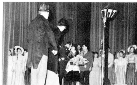
My Fair Lady.