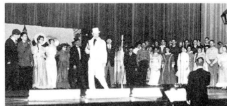
Get me to the church on time.

Our sincere and deep thanks to everyone responsible for our first Broadway size production.