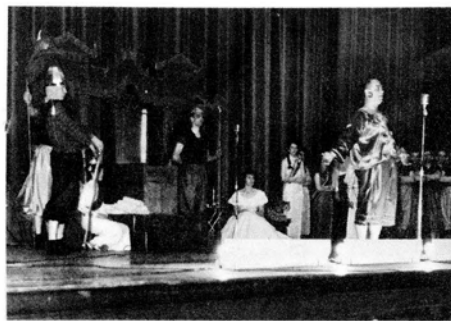
It's a puzzlement.