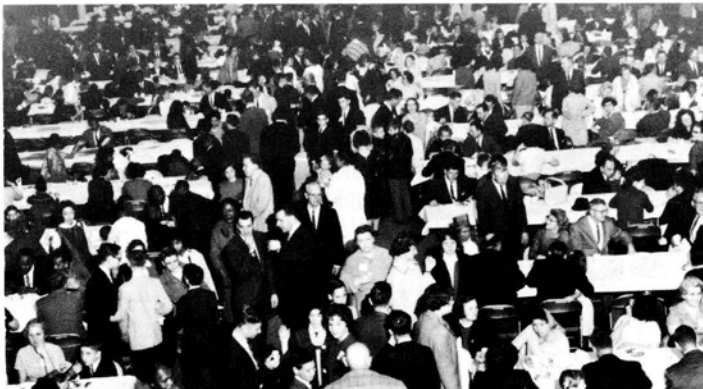
This is the Armory in Gary which served as one of the four eating places on the Night to be Much Remembered. Food was served to a capacity crowd, over 1,000.