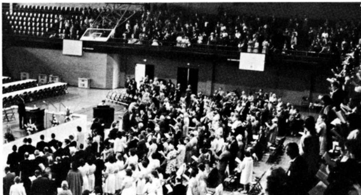
2,300 gather in the huge Hammond Civic Auditorium which has the capacity of seating 5,000. The remaining part of the auditorium was to provide ample space for the noon meal.