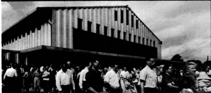
Big Sandy, Texas