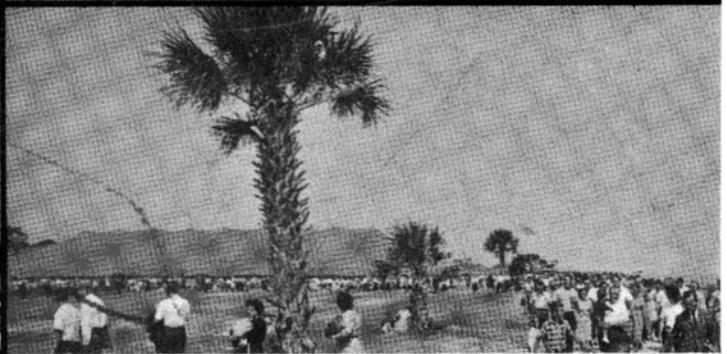
Jekyll Island, Georgia