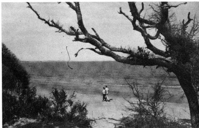
Away from the world—Jekyll Island