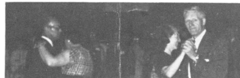
Do you recognize these couples? Honored by a special dance at the social, are the two longest married couples attending.