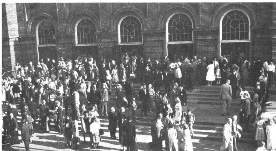
The massive Gary Memorial Auditorium engulfs the record Sabbath Day Congregation of 2,121 people for the Feast of Pentecost.