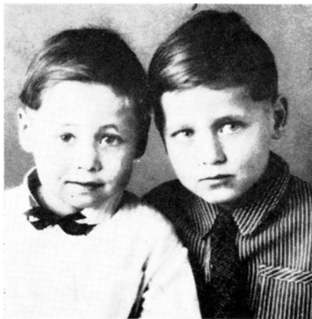
A certain Chicago area Deacon and his brother at age five. The Deacon is on your right. Guess who! Answer will appear in next month's issue.

leashed. Some of it must have been stored up for years! It certainly was obvious there is a lot of pep still left in some of the "elderly" men. Just in case some of you wonder what volleyball is, it's a cousin to basketball. The game was invented in 1895 by a man who felt basketball was too tiring for some people. This very simple game which requires little or no running is perfect for those who may feel they can't exercise. This game doesn't require any special gear. Just bring yourself and a pair of sneakers.