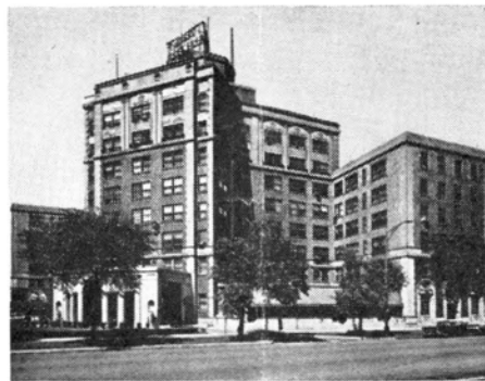
The Luxurious Graemere Hotel is the New Meeting Place for the Chicago Colored Church of God, Chicago Colored Spokesman Club and Wednesday Night Bible Study