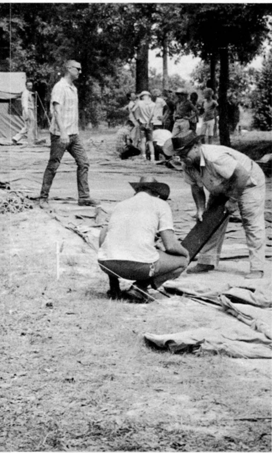
Sandy Ready Boys' Camp

Too soon, the last day dawned and on July 20, we broke camp and loaded up. As the bus rolled along back to the Church grounds, there were many pleasant camp memories. This year's camp has entered the past, but the keen anticipation for next year's high adventure has already started with such words as, "WOW!!! NEXT YEAR, I'LL . . .!"