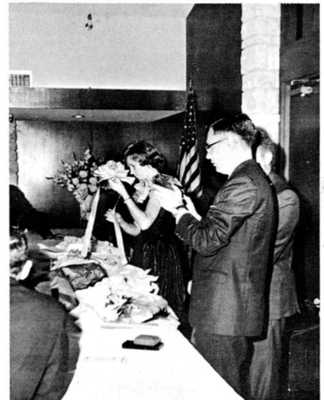
Rices Open Presents

The sumptuous food during lunch restored the spirits of the players for an afternoon of the same thing. The group broke up early to make ready for the on-coming Holy Day—Pentecost. Many of the out-of-town members stayed with the Little Rock brethren that evening.