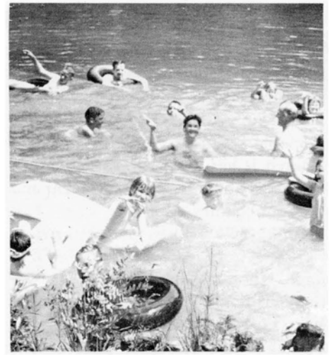
Final Event at Bender Lake

"Wait'll we get this one paid for!" he advised with a wink and a grin.