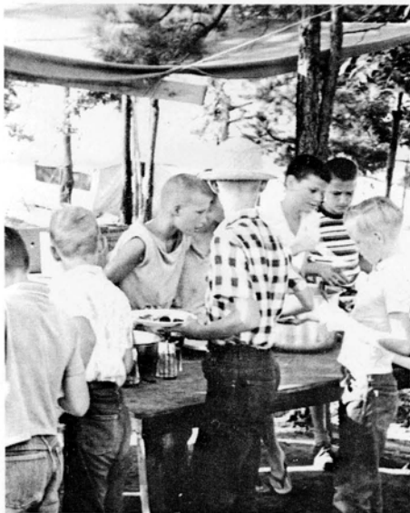
Line Up for Chow!

knots, and first aid. One period was devoted to foil cookery, and then it was tried out for the evening meal with each boy doing his own. From the remarks, this meal was a tasty success and a few parents may get involved in backyard cookery as a result.