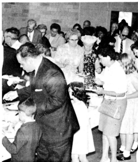
Hungry Brethren Line Up