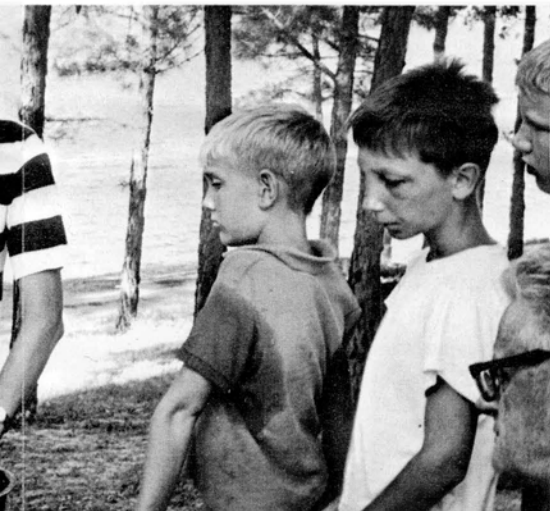
Use Pans, Fellows!

Too soon, the last day dawned and on July 20, we broke camp and loaded up. As the bus rolled along back to the Church grounds, there were many pleasant camp memories. This year's camp has entered the past, but the keen anticipation for next year's high adventure has already started with such words as, "WOW!!! NEXT YEAR, I'LL . . .!"