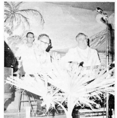
Polynesian Dance in Houston

All guests—wearing door gifts of pretty leis—enjoyed dancing amidst palm trees to music provided by a combo of Houston Church brethren. A "floor show" featuring church talent was the highlight of the unforgettable evening.