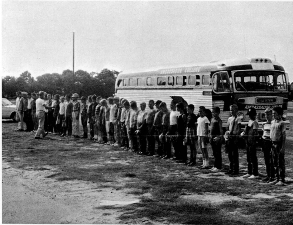
Ten—hut! All Aboard The Boys' Camp Busses

Instruction was given in such things as proper use of tentage, knives, axes,