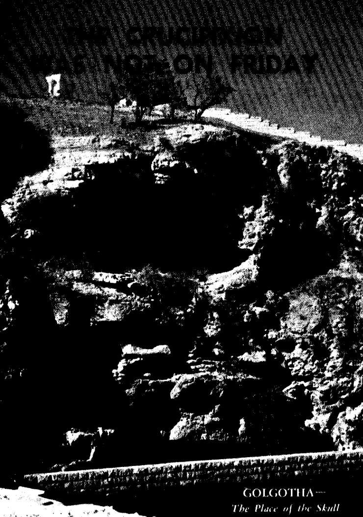
GOLGOTHA— The Place of the Skull

Golgotha — the place of the skull — where humanity crucified and murdered Jesus Christ. In the general area of the trees on top of the rock is the place where the gruesomely disfigured body of our Creator and Saviour was nailed to the stake, contemptuously hung and publicly displayed for all passersby to see and ridicule (Mark 15:29). (The above picture is the cover of an Ambassador College publication which details the circumstances surrounding this most critical event in human history. We'd be happy to send you one — free, of course.)