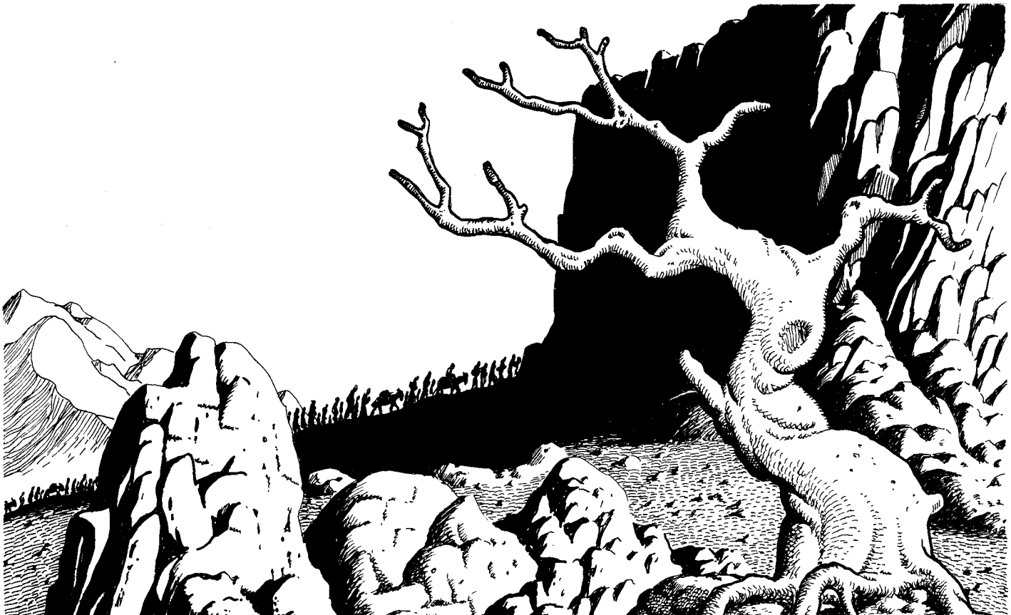
Many of the inhabitants of Nineveh were so troubled by Jonah's warning that they fled from the city and rushed to the mountains to find places of refuge.

An ominous, nerve-racking silence came over Nineveh as the hours dragged by. The fortieth day dawned. Thousands fearfully wondered if the end