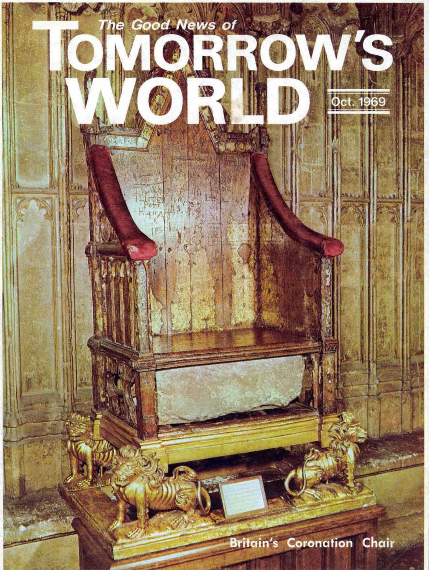
Britain's Coronation Chair