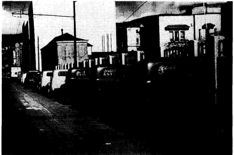
Trucks made in Koln, Germany, lining street in busy Valparaiso, Chile. Notice place of manufacture written in window of nearest truck. German imports are increasing greatly in South America. Thus leading to the fulfillment of startling prophecies in your Bible! See article on opposite page.

Copyright, October, 1957 By the Radio Church of God