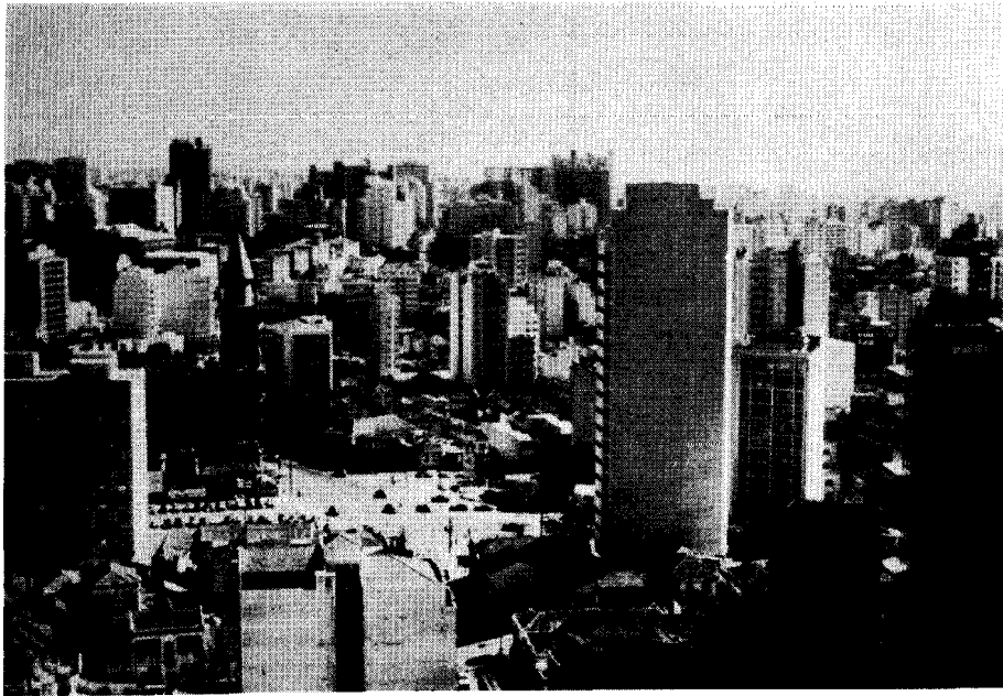
A section of the downtown skyline of modern Sao Paulo, Brazil. This is the prosperous center of Brazilian heavy industry.

The Costa Rican had attended school in this country and had become much more acquainted with the Americans and their customs. According to him, opportunity abounds, but American youth is not taking advantage of this great opportunity. He said that they think only of "Rock and Roll" and Elvis Presley.