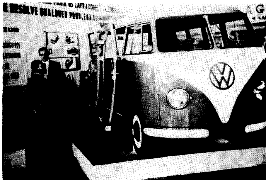
A Volkswagen on display at trade fair in Rio de Janeiro, Brazil. German advertising and selling methods, plus industrial ingenuity, present imposing competition to other major trading nations.

of South American industry presents a grave danger to the United States and Great Britain!