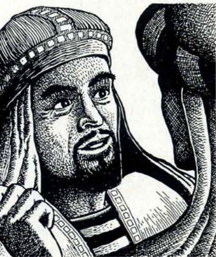
Boaz protected Ruth and instructed his harvesters to leave extra grain in the fields for her to gather.

Although Ruth is the central figure in the book that bears her name,