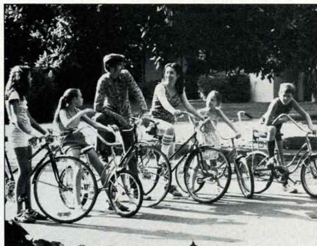
Realizing that lifelong habits and attitudes are formed early in a child's life, promoting family togetherness is one of the elements of the youth program

Herbert W. Armstrong put it this way: "Training and instructing children is definitely a parental responsibility, but if the Church can motivate and educate parents to be more successful in this area, it should do so." □