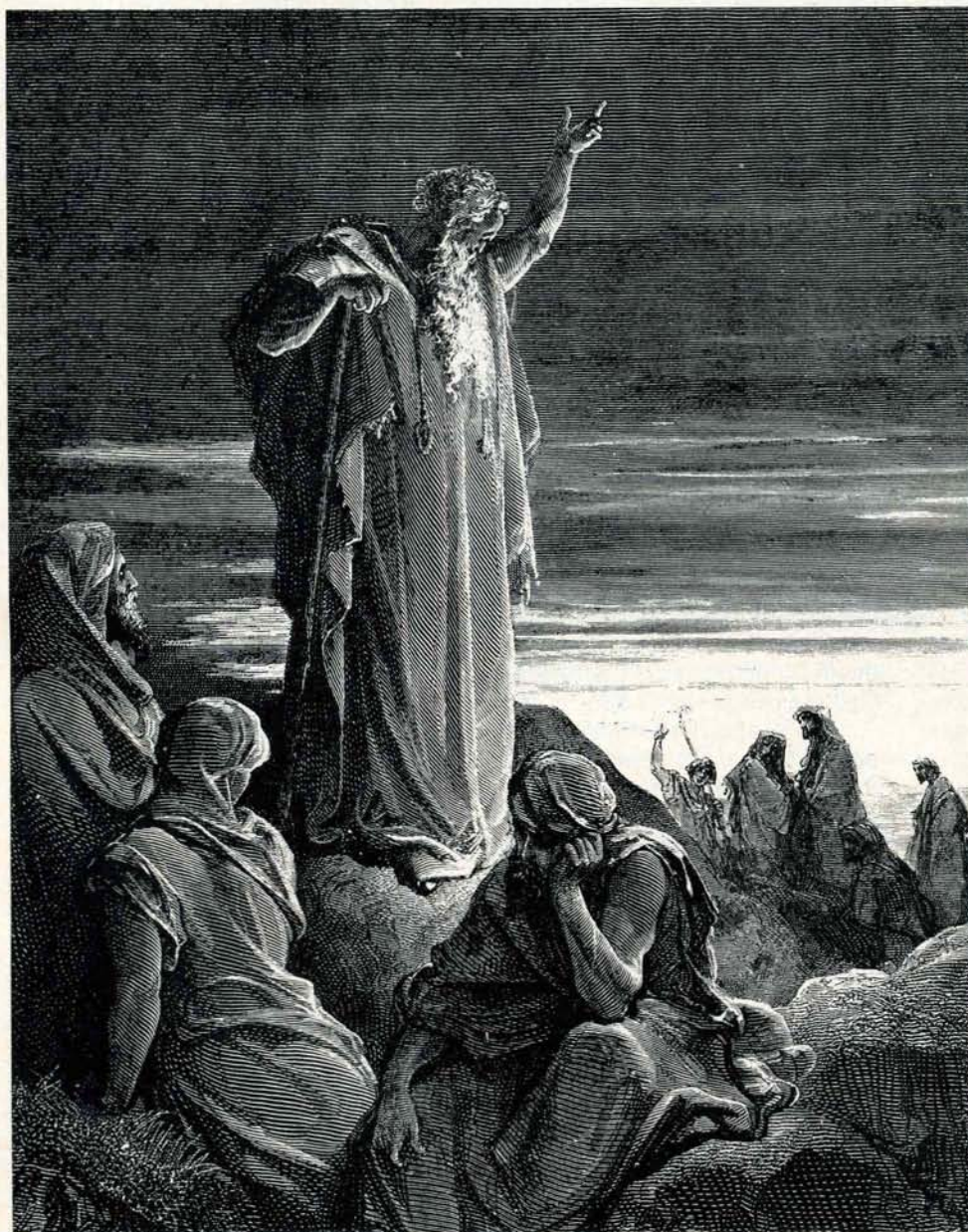
Illustration by G. Dore

The prophet Ezekiel was not able to go to Israel in his day because he was among the captive Jews in Babylon. Today God has raised up His Work to carry Ezekiel's message to the "lost" house of Israel, whose identity He has revealed.