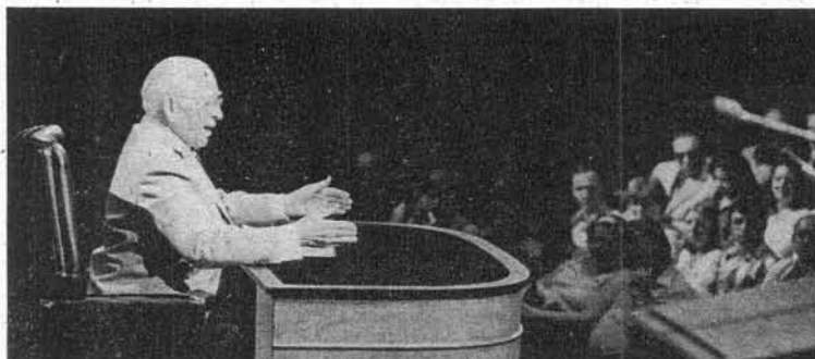
FEAST MESSAGES — Herbert W. Armstrong delivers two messages July 21 and 22 to be shown at all sites during the coming Feast of Tabernacles. The message recorded during the first part of the weekly Friday-night Bible study will be shown at opening-night services at the Feast, and his full-length sermon the next day is scheduled to be shown at services on the first Holy Day during the Feast.