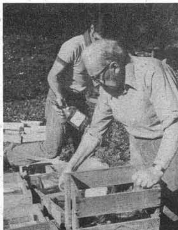
BOTTLED UP — Families of the Auckland, New Zealand, church collect and sort some of the 140,000 bottles they gathered in a $3,500-fund-raising effort June 18. The proceeds will help finance a future series of advertisements in New Zealand. (See "140,000 Bottles," this page.)