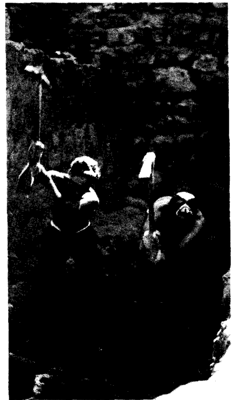
"Last year I couldn't spell ARKYOLIJIST — now I ARE ONE!"

vided right from our front door to the working area. Transportation to Jerusalem for students who wish to shop or do sight-seeing is provided by a city bus which stops about a block from our hotel. Busses stop running at eight p.m., although there are taxis available at all hours.