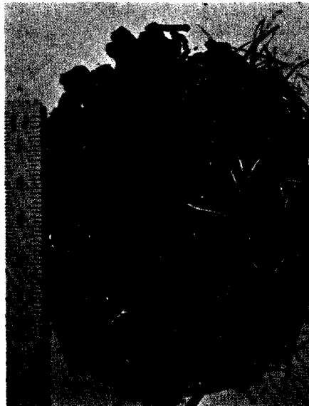
Maidani — Ambassador College

But meanwhile, grazing access to the whole farm lowers the stocking rate and encourages a much greater bulk of grass in every pasture! That means