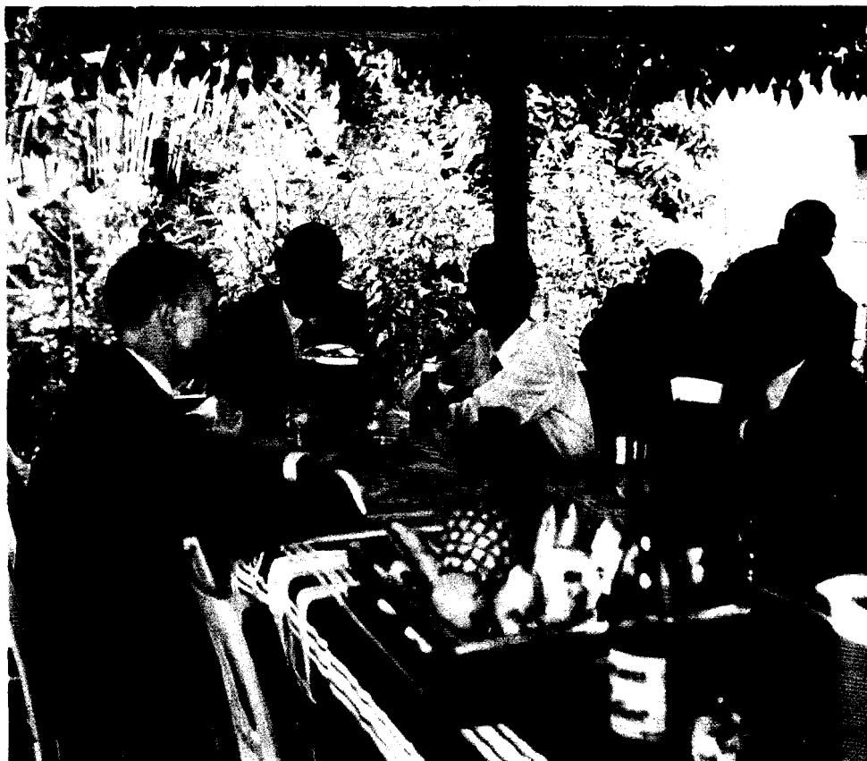
Neff — Ambassador College

Our two visitors from the little island of St. Kitts had a fine attitude. We baptized them just before sunset, at the hotel's private beach in most beautiful surroundings. In all probability, they will read these lines in the very first issue of The GOOD NEWS they will receive. If so, we extend to them