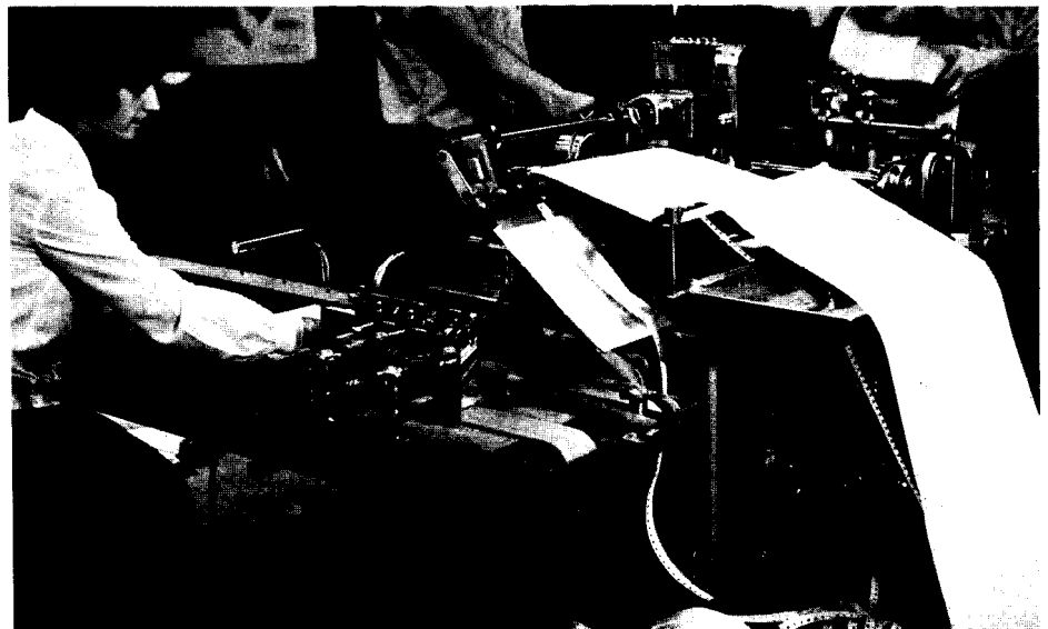
Here's the Cheshire mailing machine in action with a stack of PLAIN TRUTHS entering on the right and labeled for mailing at six per second!

With the fastest machine available, God's Work is set to LEAP ahead.