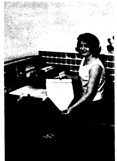
A roll ready to be perforated.

RIGHT, The most frequently used letters from the L. A. D. master file are "typed" on a perforator, which punches holes in a roll of paper. Then this paper is played like a player piano, and out comes a perfect form letter. It looks as good as the hand-typed version, but cuts the time in half. This finger-less typewriter speeds along at 120 words per minute, saving God's Work both time and money!