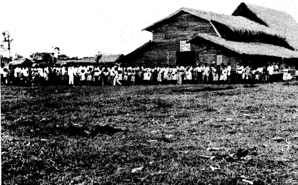
First Philippine Feast of Tabernacles at Kiara, Mindanao.

The natural ability of the Filipino people to follow will be used by God to great advantage in the Church today, and in His government in the World Tomorrow. The people will follow those in authority and are obedient to them once they are converted. For this reason God has chosen the Filipinos to be His people today in the Far East. He knows that they will submit to authority readily and obey that authority. They have been trained to submit to authority during 400 years of foreign rule. Unconverted, they will often stick