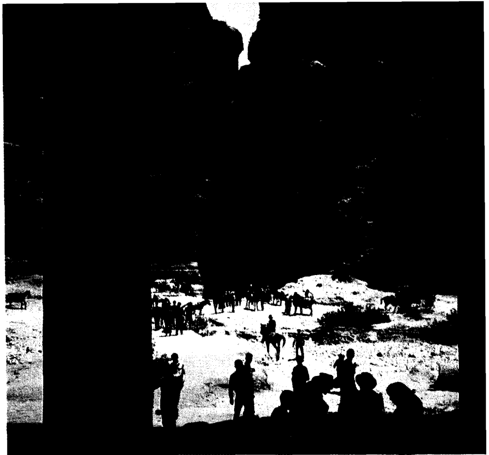
Tourists seek shelter from the sun in the "Treasury" cave, while others mill around in the sun at the Siq entrance.