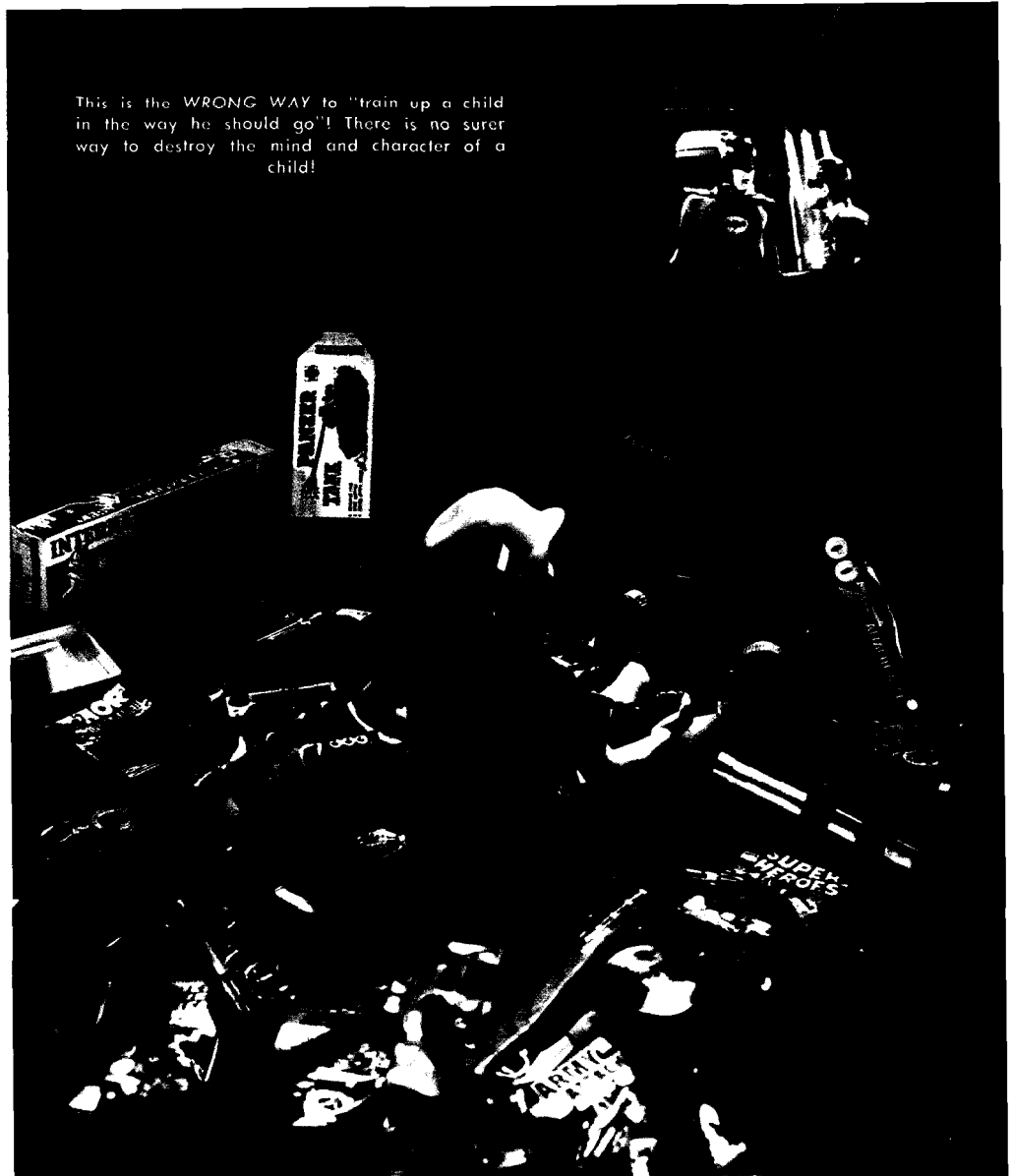
Ambassador College Photo

The person who can truly enjoy a good time better than all others is a