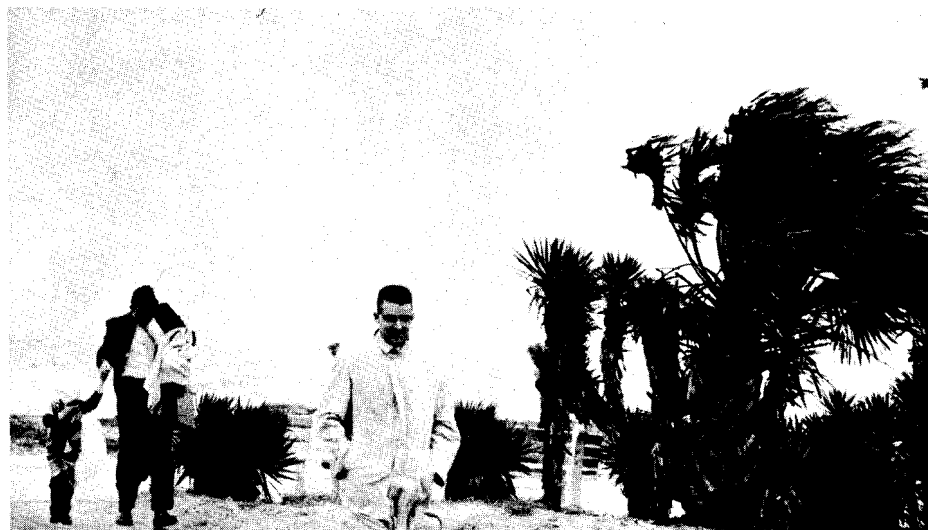
Several brethren brave the strong winds as they make their way back to their room following interruption of services at Jekyll Island last year.

These are some of the good examples. There are hundreds more like them!