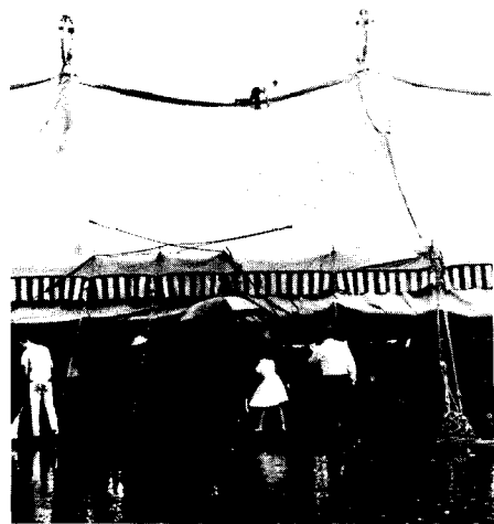
A hearty crew of willing hands heave ho baling down loose ends during a lull in the storm last year at Jekyll Island.

These are only a few of the incidents that occurred at the Feasts in Jekyll Island, Big Sandy and Squaw Valley. There are many other incidents of similar nature that occurred at Blackheath, Hayling Island, Fort-de-France, Merri-